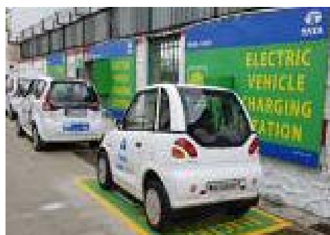
Tata Power's EV Charging infrastructure to enable India meet ambitious plan by 2030