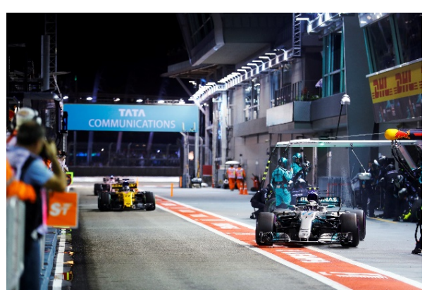
Tata Communications provides connectivity to F1 races across race locations and connects 1 mn fans