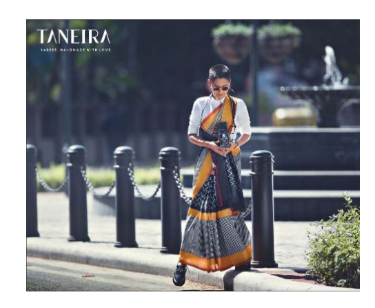
Taneira offers traditional Indian weaves fused with contemporary designs and colours