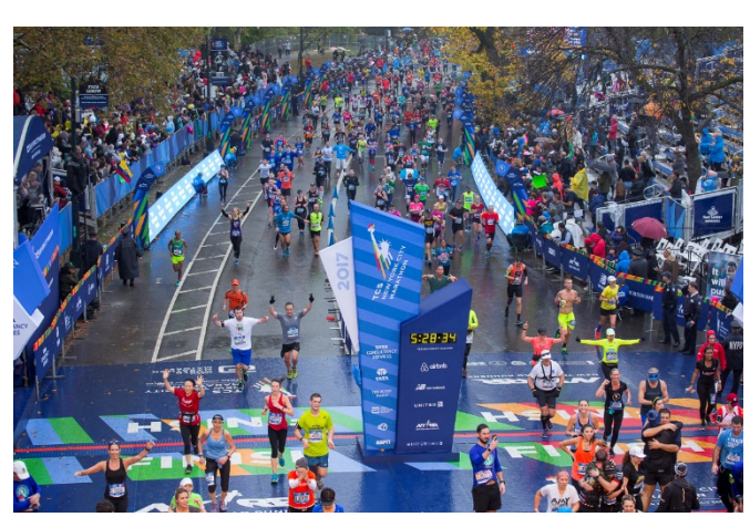
TCS New York ReflexCity Marathon app

650 mn+ lives touched 75 mn+ retailers footfalls 1,700+ owned retail stores access to 200,000+ retailers 10,000+ vendor network (TIER 1)