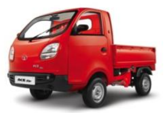
Intra-city light truck – Tata Motors' Ace