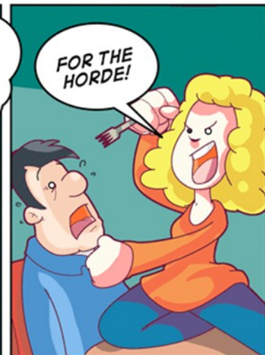
ALTERNATE GAMER RESPONSE