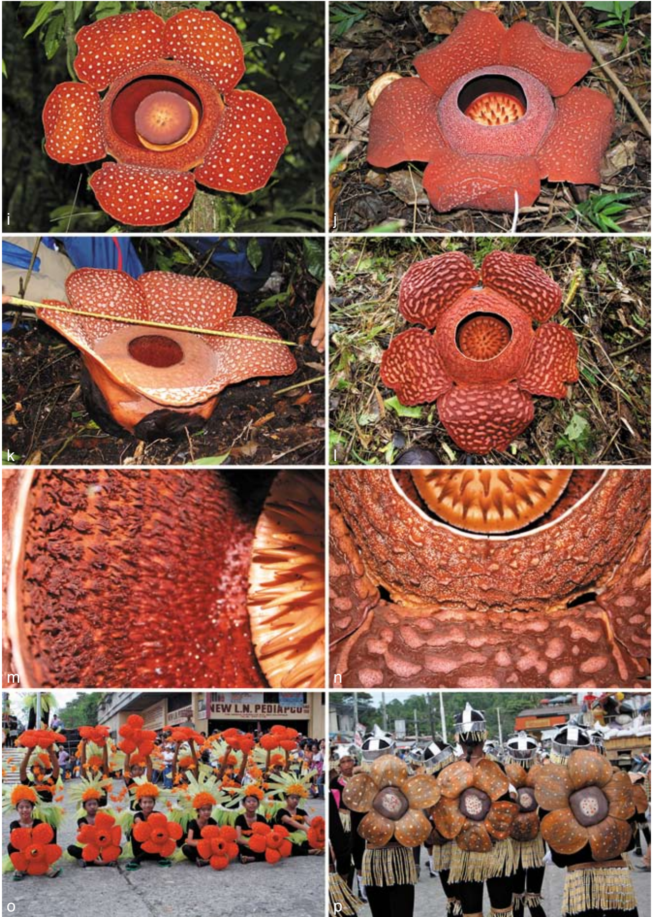
Plate 3 (cont.)