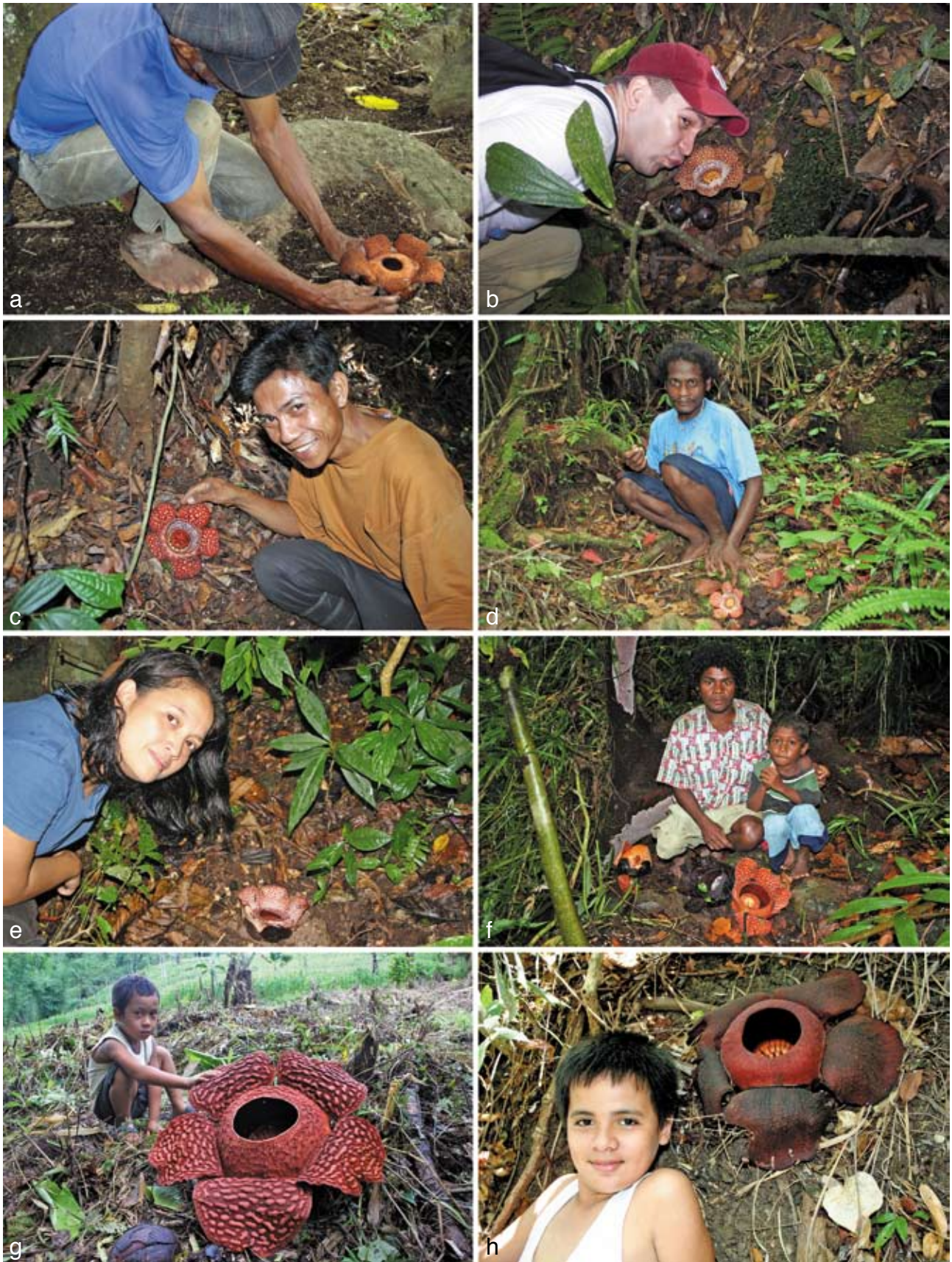
Plate 2 Philippine Rafflesia flowers in situ, showing their relative sizes. a. R. baletei, Mt Isarog; b. R. lobata, Mt Agua Coloña; c. R. manillana, Mt Labo; d. R. manillana, Kanapawan; e. R. philippensis, Mt Banahaw; f. R. leonardi, Kanapawan; g. R. schadenbergiana, Baungon; h. R. speciosa, Valderrama.