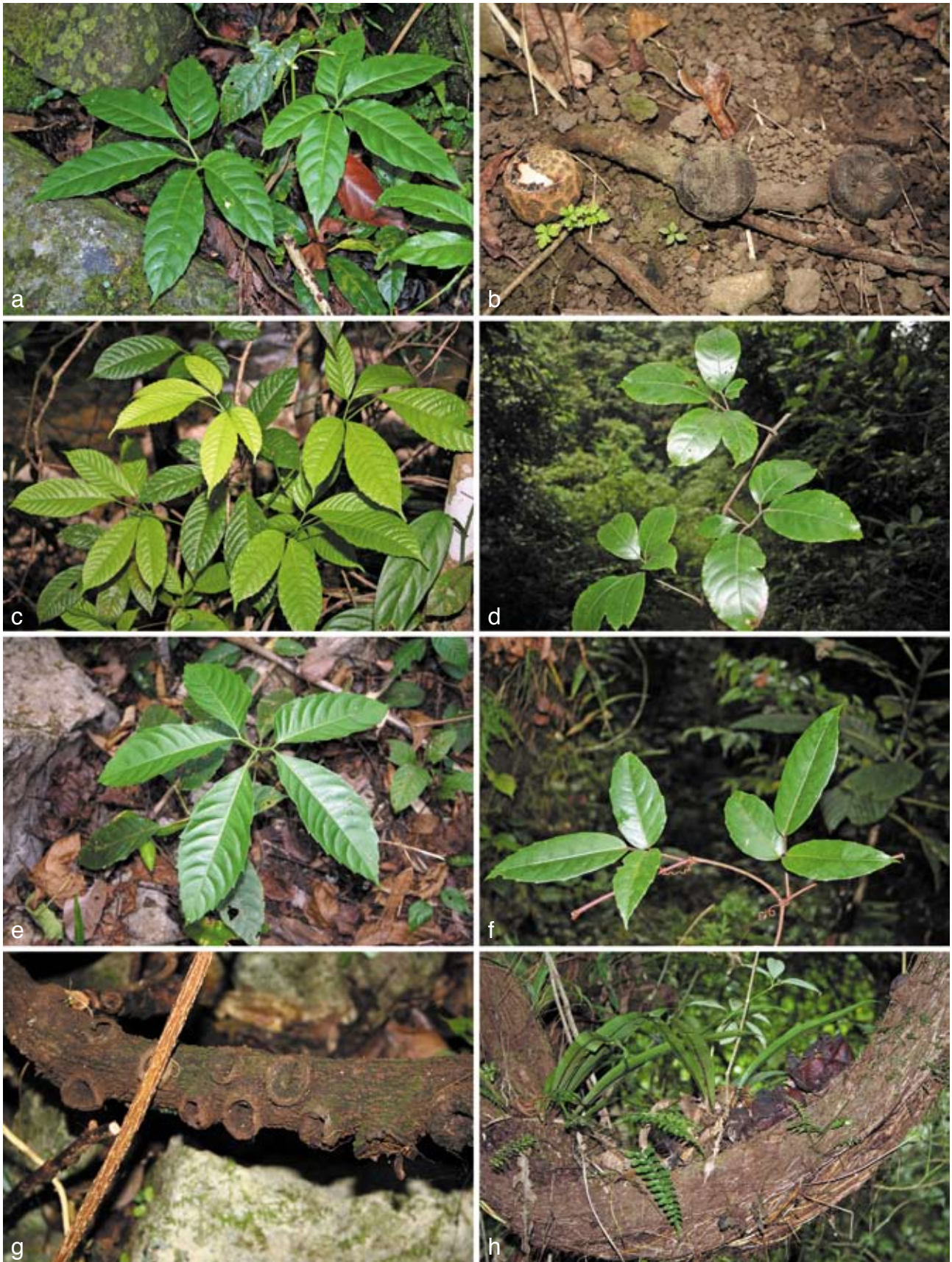
Plate 1 Tetrastigma (Vitaceae) species found as hosts of Rafflesia. a, b. Tetrastigma piscarpum, host of R. philippensis on Mt Banahaw: a. leaves, b. above-ground roots with emerging Rafflesia buds; c. Tetrastigma papillosum, host of R. schadenbergiana on Mt Kitanglad; d. Tetrastigma sp., host of R. manillana on Mt Natib; e. Tetrastigma sp., host of R. speciosa in Sibalom Natural Park; f–h. Tetrastigma cf. loheri, host of both R. manillana (in Bolos Point and Kanapawan, and possibly on Mt Labo) and R. leonardi (in Kanapawan): f. trifoliate leaves, g. prostrate vine with scars of R. manillana flowers, h. host plant of R. leonardi.