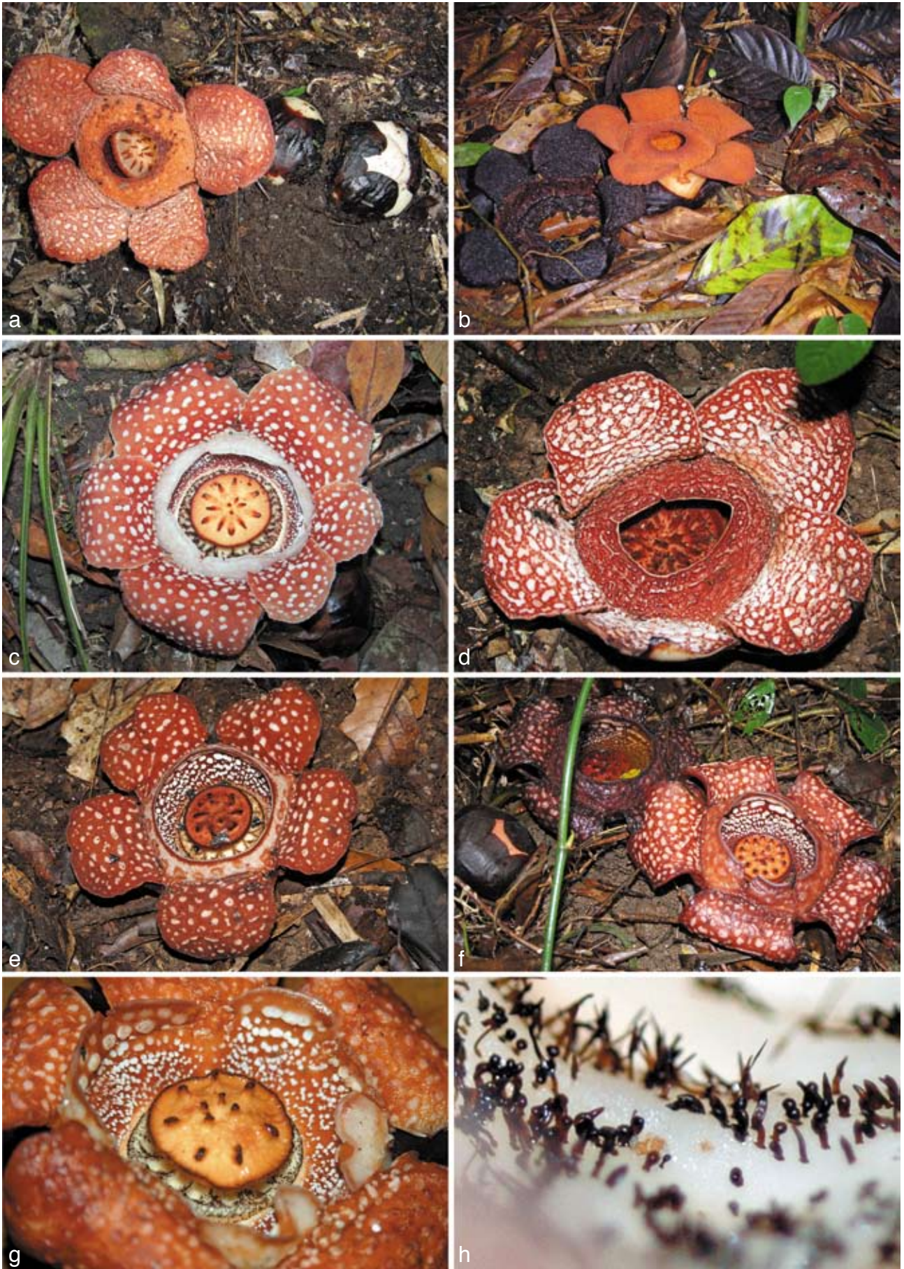
Plate 3 a–l. Philippine Rafflesia species. a. R. baletae, Mt Isarog; b. Rafflesia sp., Sierra Madre Mountains; c. R. lobata, Mt Agua Colofia; d. R. philippensis, Mt Banahaw; e. R. manillana, Mt Labo; f. R. manillana, Mt Natib; g, h. R. manillana, Kanapawan; i. R. leonardi, Kanapawan; j. R. speciosa, Valderrama; k. R. mira, Mt Candalaga; l–n. R. schadenbergiana, Baungon; o, p. Rafflesia as symbol for nature conservation, Buruyuganay Festival, Panay. Antique Prov., Sibalom.