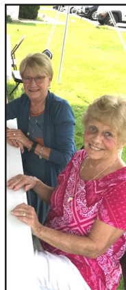
Fun & Games!