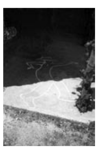
Historic Billy the Kid death site, including chalk line!

of the cities to turn the water on to the heater, Mary has been reading the Sunday paper and when she finished a section she would wrap it around her legs. With the heat on we can now use the paper to sop up the water coming in everywhere. The wind is really blowing and driving the rain in the car. We get to Des Moines and have to stop and shut