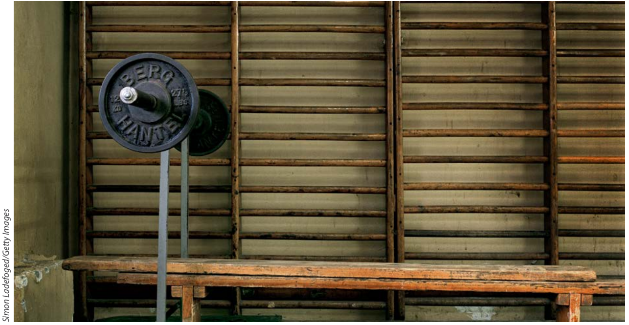
Before the '50s, fitness facilities were rugged, sparse places where equipment was often very limited. Stall bars were a fixture, as were medicine balls, dumbbells and barbells.

The owners of these new enterprises knew their potential members wanted something different from what was being offered at the local YMCAs—something more modern, something that made training easier. And the atmosphere of these new fitness centers needed to be more inviting, so there was background music and lots and lots of mirrors. Instead of barbells, the various