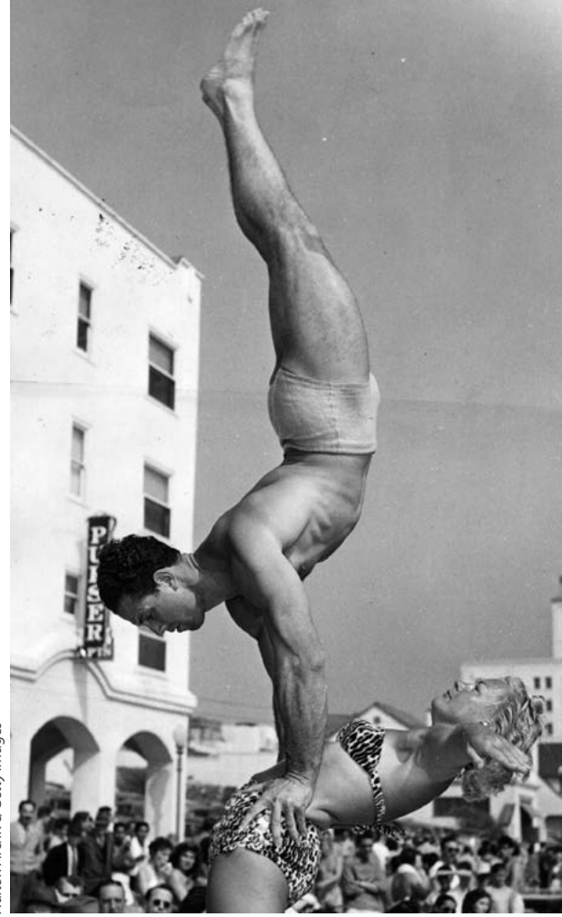
Harold Zinkin, inventor of the Universal Gym, displays impressive skill at Muscle Beach in California.

There was a machine for each of the exercises in the program, and the machines available differed from one facility to another depending on what the owners considered the