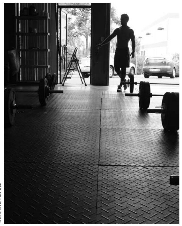
The appeal of machine training is fading in some areas, sending athletes in search of CrossFit gyms and garages stacked with barbells and bumpers.

Why? Using barbells and dumbbells forces the tendons and ligaments to get more involved. When an exercise is done on a machine, those attachments receive very little