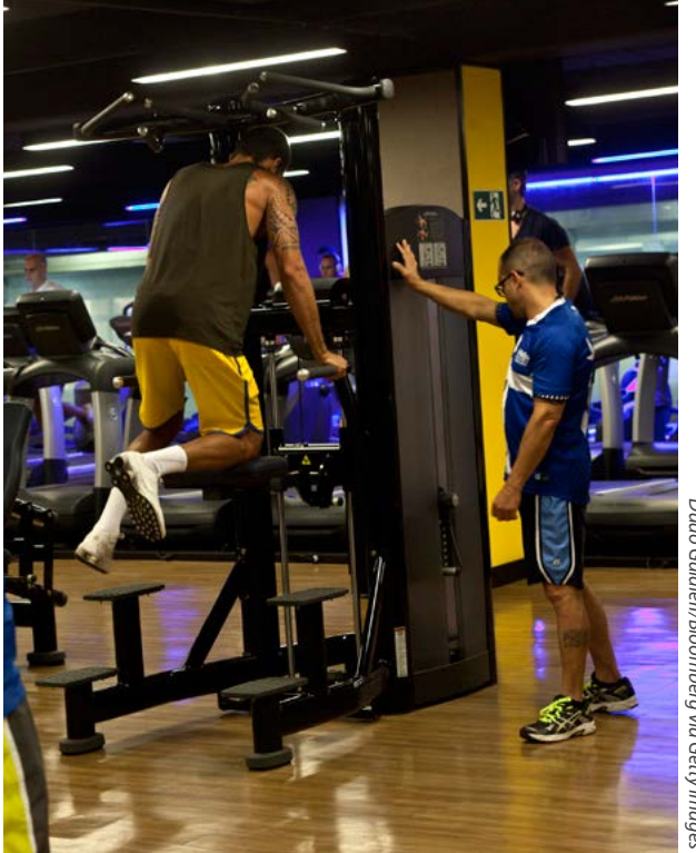
"Weight rooms are no longer designed with productivity in mind." —Bill Starr

By the mid-'80s, Nautilus equipment went the way of Universals. They were sold or moved to storage or given away to high schools or community centers. Yet the machine revolution didn't go away. It just changed its face. Newer types of machines appeared on the market,