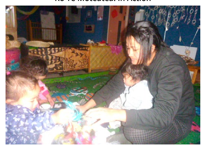
Ko Te Mōteatea: In Action

Kaiako reflections on 'what's happening here' highlight the role of kaiako, to bring the moteatea to life with and for tamariki.