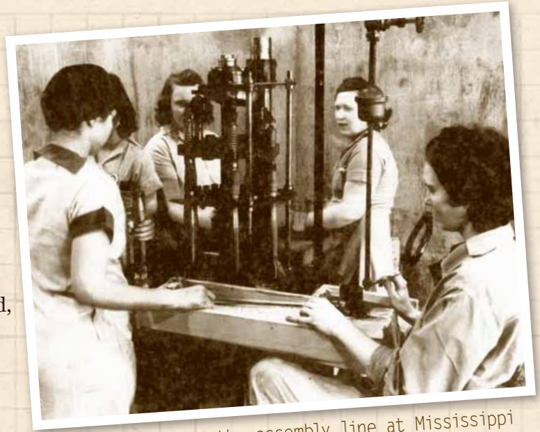
> Women working on the assembly line at Mississippi Gulf Ordnance Plant in Prairie, MS.