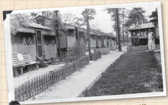
> Outside POW barracks at Camp Shelby, MS