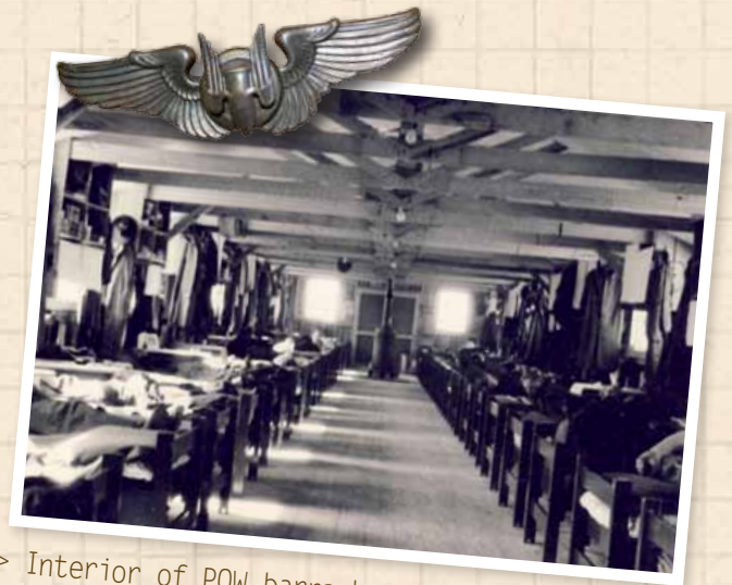
> Interior of POW barracks at Camp Clinton, MS