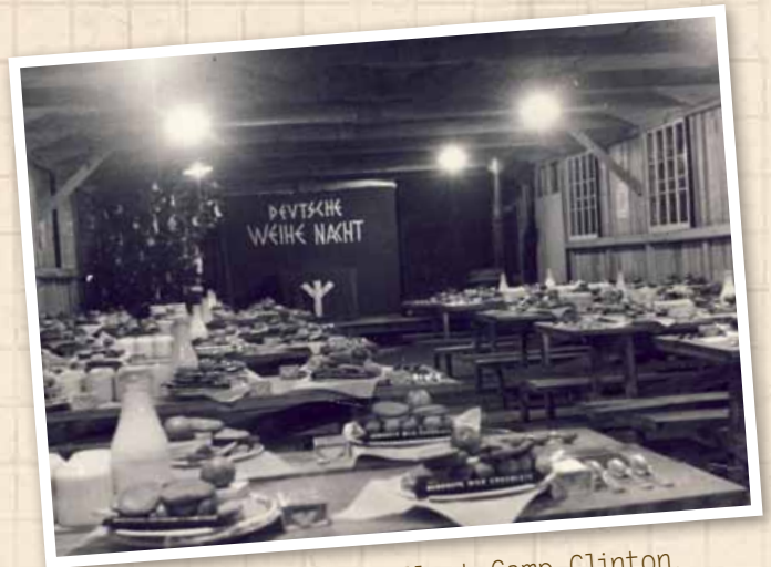
> German POW dining hall at Camp Clinton.