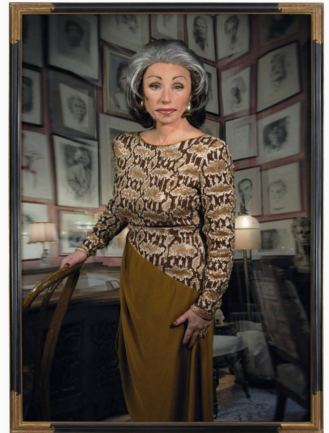
Cindy Sherman, Untitled #474, 2008