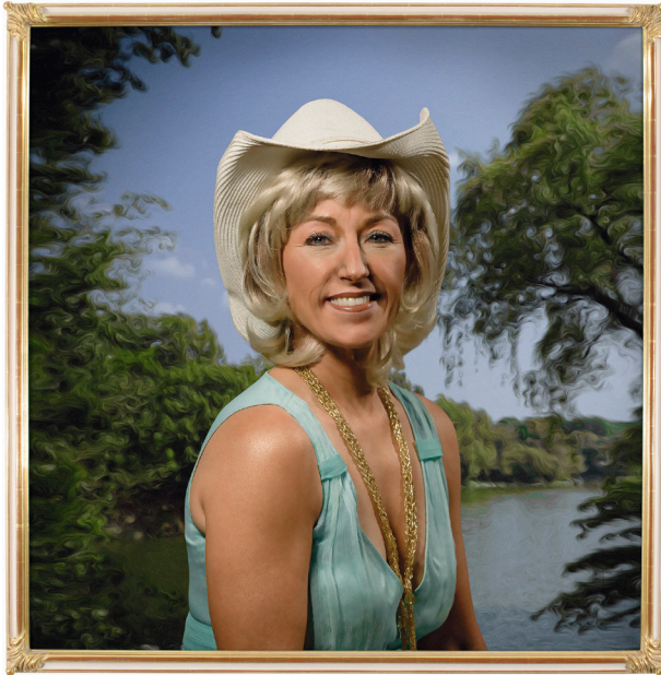
Cindy Sherman, Untitled #468, 2008

In “Society Portraits” Sherman addressed issues of age and social status. The mature women depicted in these imposing portraits are confronting their advancing years and, as her masquerade in each image suggests, are resorting to cosmetic strategies to sustain an illusion of youthfulness. Despite make-up and evident recourse to surgery, the difficulty of maintaining a look that conforms to social expectations has a desperate aspect. (1)