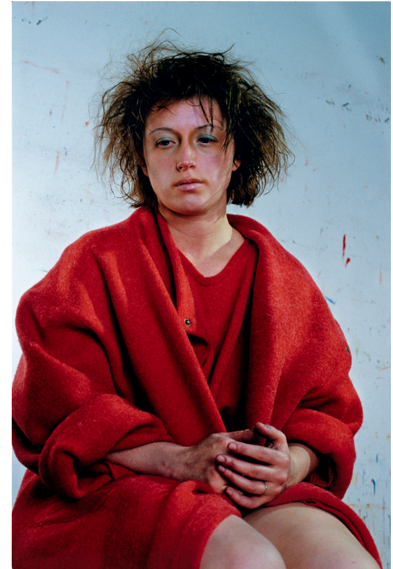
Cindy Sherman, Untitled #137 , 1984, Courtesy of the artist and Metro Pictures, New York