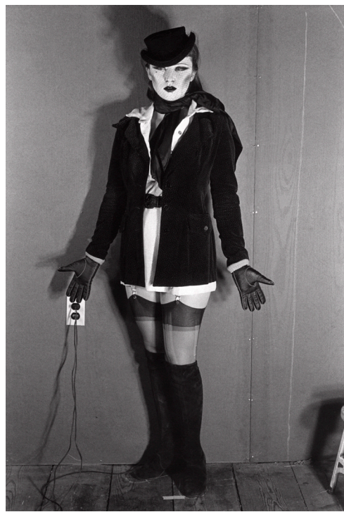
Cindy Sherman, Untitled #501, 1977/2011