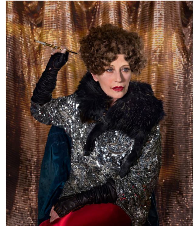
Cindy Sherman, Untitled #580, 2016