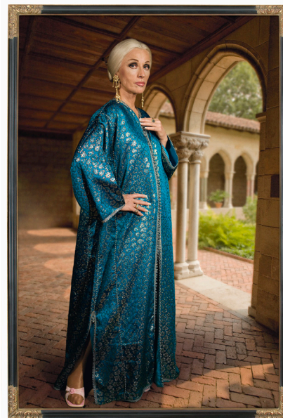
Cindy Sherman, Untitled #466 , 2008, Courtesy of the artist and Metro Pictures, New York