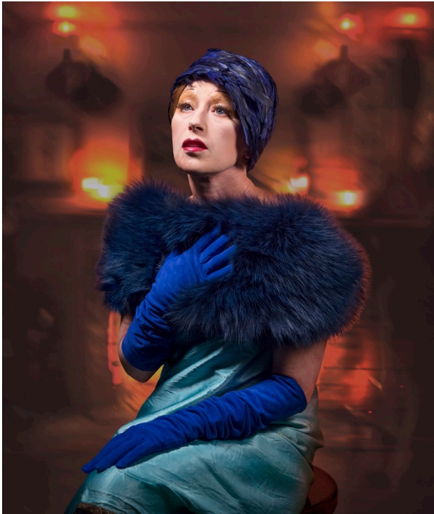
Cindy Sherman, Untitled #574 , 2008, Courtesy of the artist and Metro Pictures, New York

In 2016 Sherman commenced a series of photographs inspired by the look of a distant age. Adopting hairstyles, make-up and fashions worn by women in the 1920s, she created several different characters, which she described as 'flappers'. That term refers to a generation of young women that emerged after the First World War, whose appearance and behaviour flouted convention. Characterised by conspicuous make-up, bobbed hairstyles and smoking in public, they conveyed an impression of liberated sensuality that contrasted with earlier norms of femininity. The theme of actresses is an appropriate metaphor for Sherman's own art, throughout which the artist appears in a succession of fictitious roles. (1)