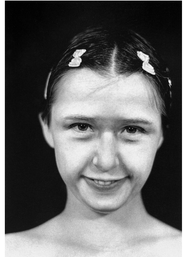
Cindy Sherman, Untitled D, 1975