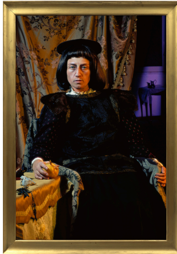
Cindy Sherman, Untitled #206, 1989