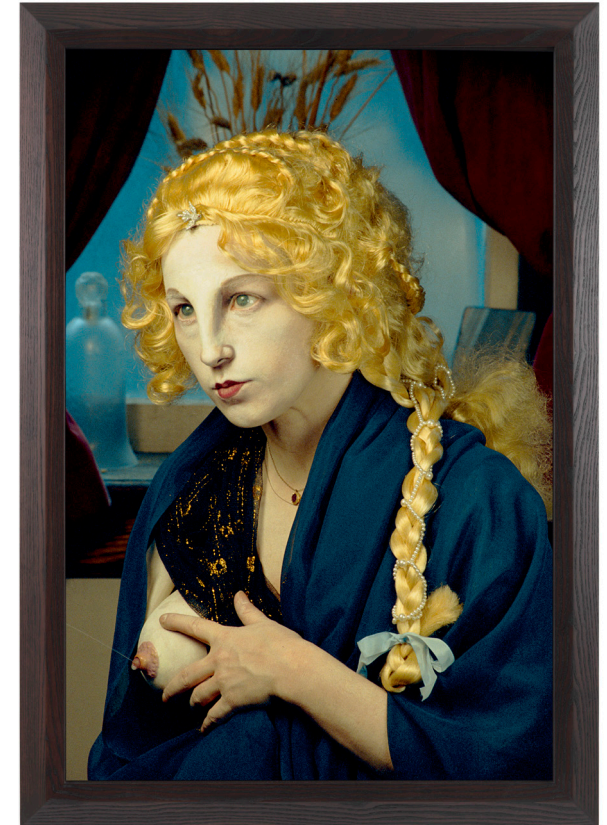
Cindy Sherman, Untitled #225 , 1990, Courtesy of the artist and Metro Pictures, New York