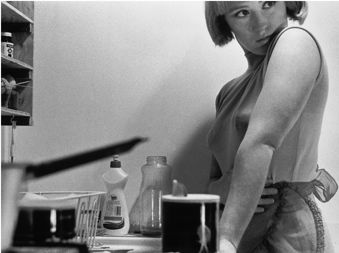
Cindy Sherman, Untitled Film Still #03 , 1977, Courtesy of the artist and Metro Pictures, New York