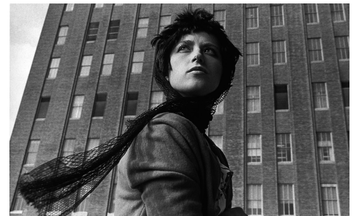
Cindy Sherman, Untitled Film Still #58 , 1980, Courtesy of the artist and Metro Pictures, New York