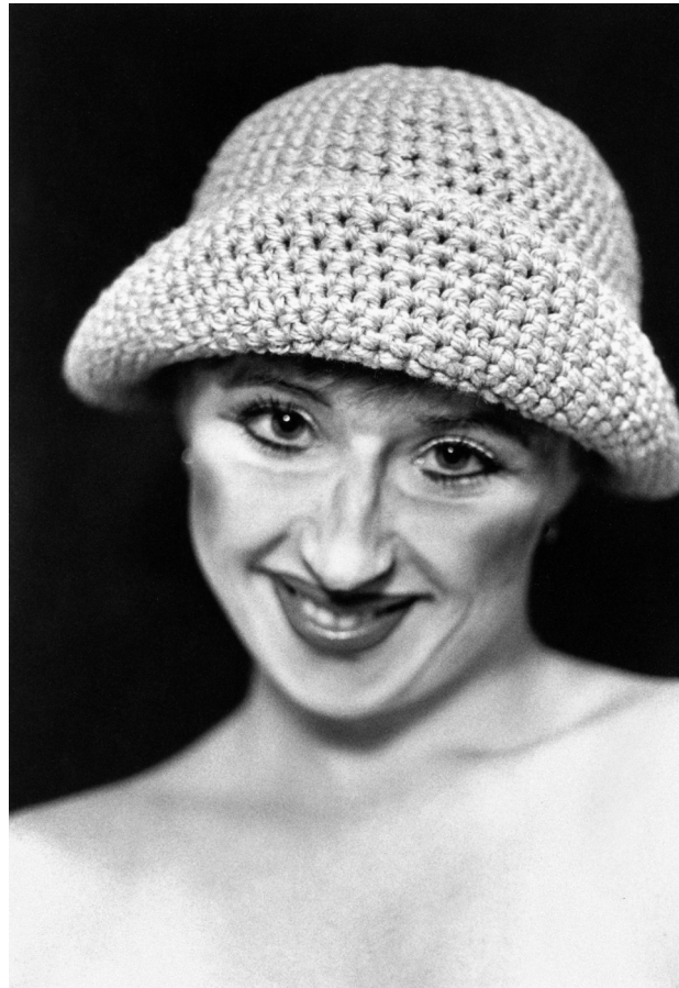
Cindy Sherman, Untitled A, 1975