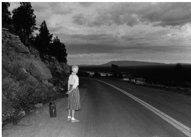
Cindy Sherman, Untitled Film Still #21 , 1978, Courtesy of the artist and Metro Pictures, New York