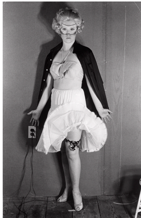
Cindy Sherman, Untitled #502 , 1977/2011, Courtesy of the artist and Metro Pictures, New York