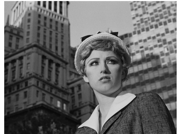
Cindy Sherman, Untitled Film Still #27 , 1979