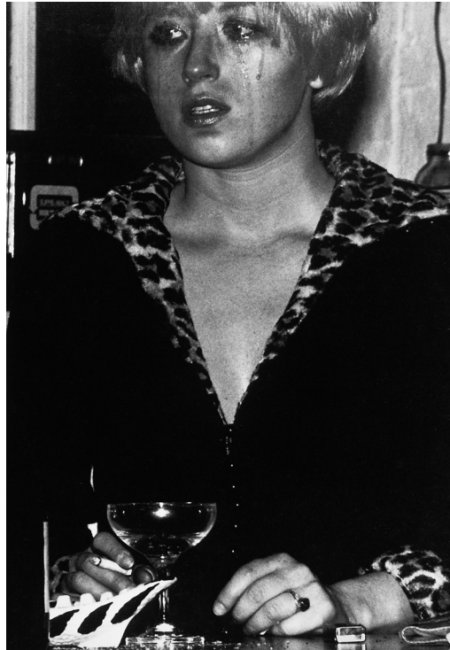
Cindy Sherman, Untitled Film Still #48 , 1979, Courtesy of the artist and Metro Pictures, New York