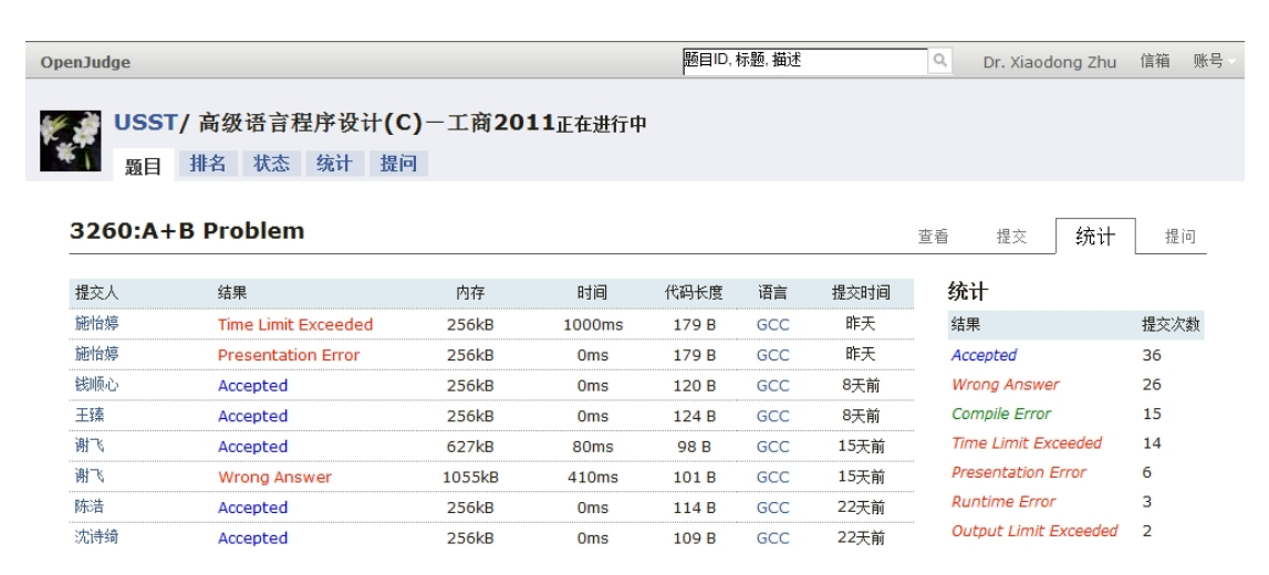
Figure 3. Online scoring platform for programming language learning

See the website (http://zxd.openjudge.cn). The author listed several competition questions about programming courses, the students could do these work online at any time before the deadline. The website automatically ranks the students according accepted number and other factors. Figure 3 shows the submission status of students while doing the "A+B problem" using the C or C++ language. The teacher could see the status clearly.