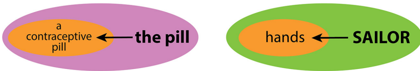
Figure 1. Diagrams inspired from Ruiz de Mendoza and Diez (2003, pp. 513-515)

This figure could easily be adapted for CNs, for example football or carrot juice, see Figure 2.