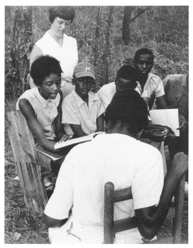
Mississippi Freedom School class.

year-long project where community people will be brought in and trained so staff can move out leaving trained personnel."<sup>25</sup>