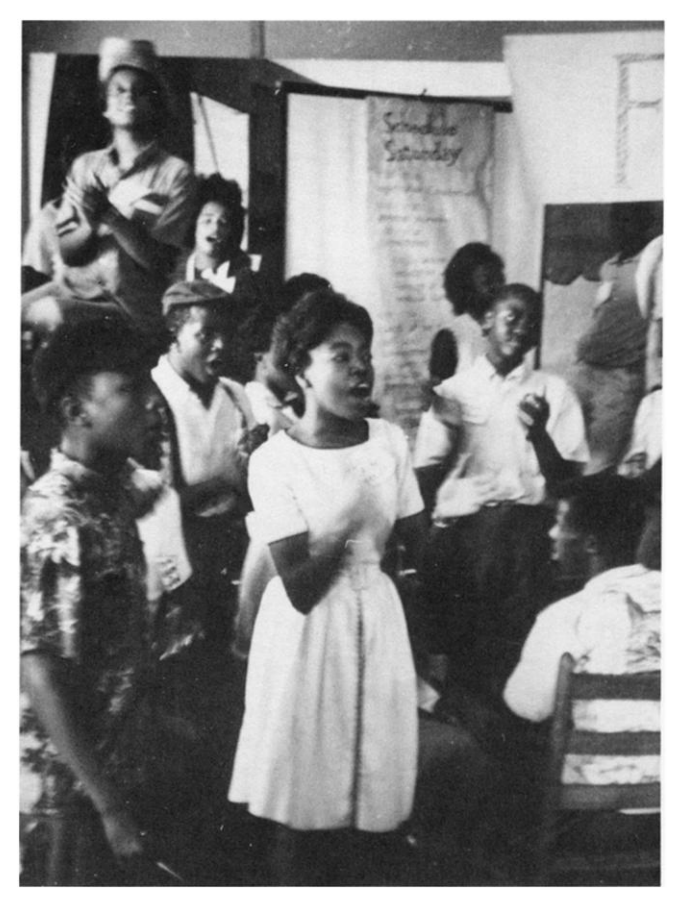
Group sing of freedom songs at the Freedom School Convention, summer 1964, in Meridian, Mississippi.