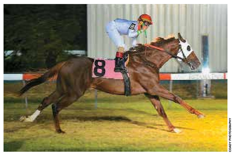
Deviant, a 2-year-old son of Daredevil, carries the Red Lane colors to victory in the El Joven Stakes at Retama Park

"I was in Las Vegas before that and had to scramble when another horse scratched and he got in, so I found my way to California and I only had one change of clothes," he said. "I was the only one wearing shorts and a pullover, so I was very underdressed, but I only got there 30 minutes before the race.