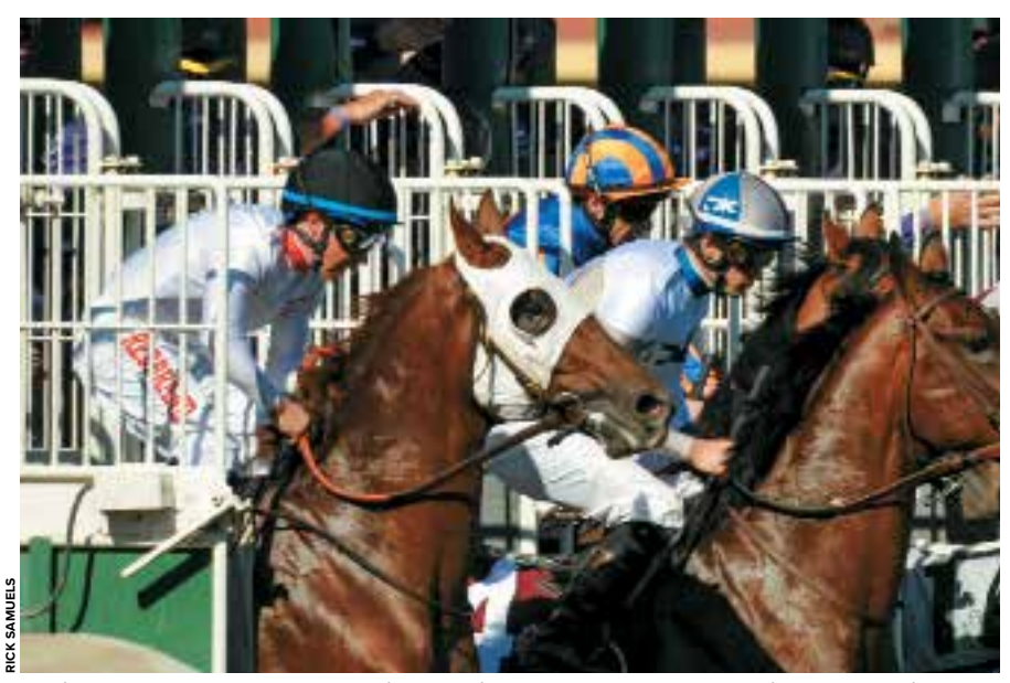
Deviant started well from the outside post in the Breeders' Cup Juvenile Turf but clipped heels in a stretch-turn traffic jam and finished unplaced

Racing also fills a personal need for Hicks.