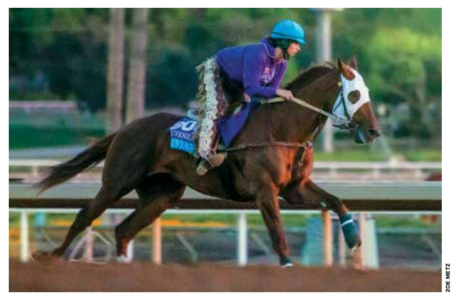
Deviant prepares for the Breeders' Cup Juvenile Turf at Santa Anita

kid who stood on the rail at Rockingham was sitting at Santa Anita on one of racing's biggest days watching a horse run that he was part of buying and managing. It was a pinch-yourself moment. We wish it would have gone differently, but it's pushed me to want to get back there and have the chance again."