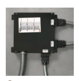
3 Power Base Zone Box