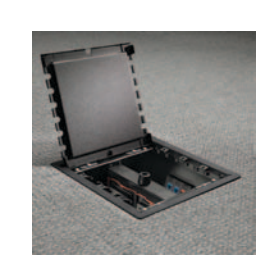
1 Power Base Floor Box

Pedestals offer 1"–2" adjustment range to easily accommodate irregular subfloors.