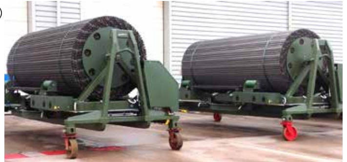
FAUN® Trackway Trackrack and Spoolrack