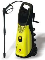
High pressure cleaner