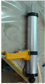
Adhesive gun & cartridges