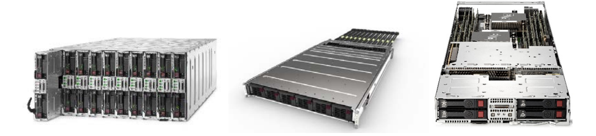
Figure 3. HP Apollo 6000 System, Apollo 6000 power shelf and ProLiant XL230a server tray.

The ProLiant XL220a Server is the first Gen9 server introduced for the HP Apollo 6000 System. Using the Intel Xeon E3-1200 v3 (codename Haswell) processors and featuring 2 single-socket servers per tray, the ProLiant XL220a Server focuses on single-threaded application performance for workloads such as Electronic Design Automation (EDA), life sciences and risk modeling. The new ProLiant XL230a Server features Intel Xeon E5-2600 v3 processors. With one dual-socket server per tray, the ProLiant XL230a Server extends capabilities for high performance computing (HPC) and service provider workloads such as seismic processing, virtualized and/or dedicated hosting.