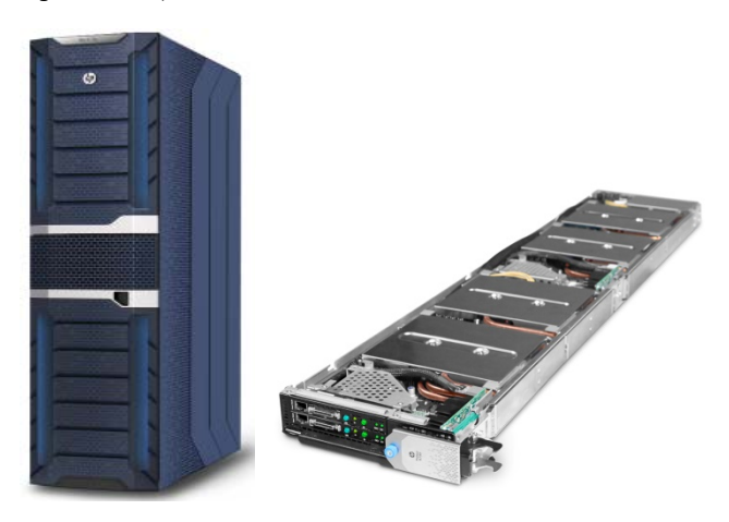
Figure 4. HP Apollo f8000 Rack and ProLiant XL730f Gen9 Server

For Gen9, the Apollo 8000 System begins with the ProLiant XL730f Server, which includes 2 server nodes (Table 7). Using the ProLiant XL730f, Apollo 8000 Systems are capable of delivering up to 144 teraflops of compute performance per rack.