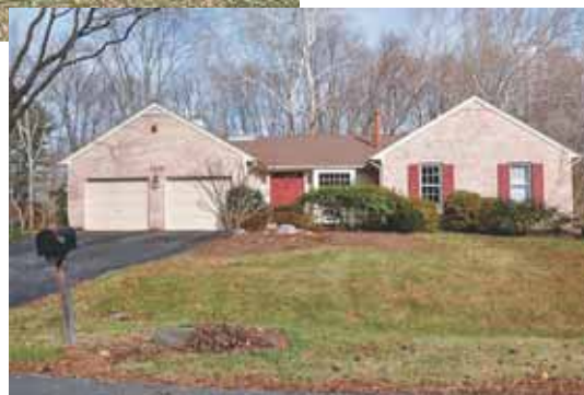
4 9329 Copenhaver Drive — $778,000