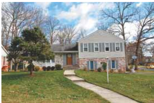
9 11801 Coldstream Drive — $662,000