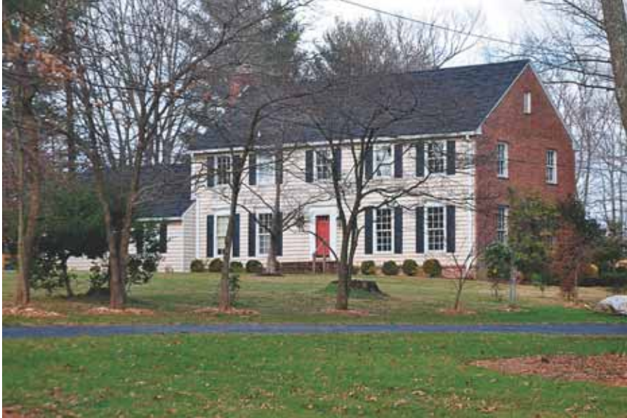
2 10605 Unity Lane — $892,500

IN OCTOBER 2014, 37 POTOMAC HOMES SOLD BETWEEN $2,500,000-$309,000.