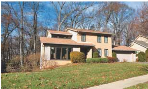
7 7 Scotch Mist Court — $751,000