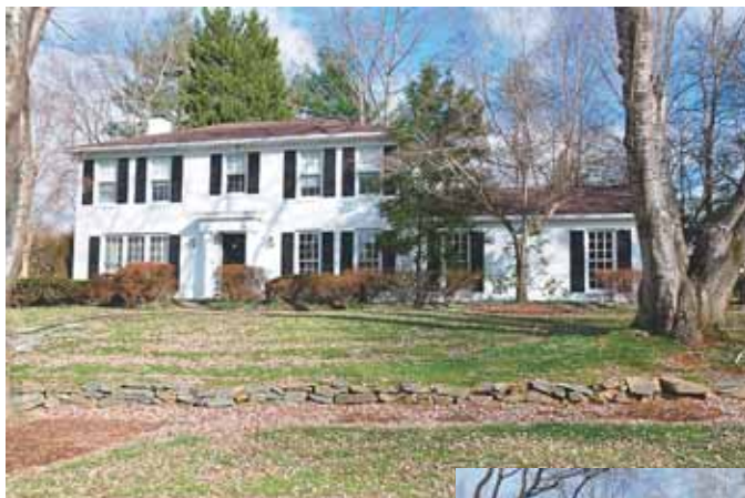
3 9621 Trailridge Terrace — $813,500