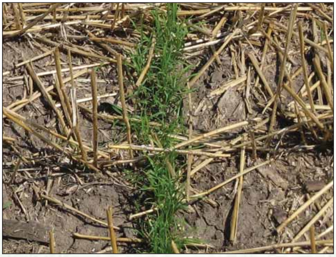
Teff seedlings in wheat stubble

Because Teff can be planted from late spring to mid-summer, it is a good double cropping option following cereal grain crops such as wheat. Teff hay has a higher profit potential than many alternatives due to its high yield and high quality.