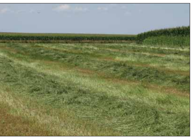
Windrows of Teff in corners of irrigated field

Farmers in irrigated areas using center pivots have been successful in utilizing Teff to obtain some production in the dryland corners. These plantings can be successful if there is adequate soil moisture at planting time for germination and establishment. Once established, Teff's low water requirement and subsequent drought tolerance has the potential of providing growers with additional hay production for on farm use or hay sales.