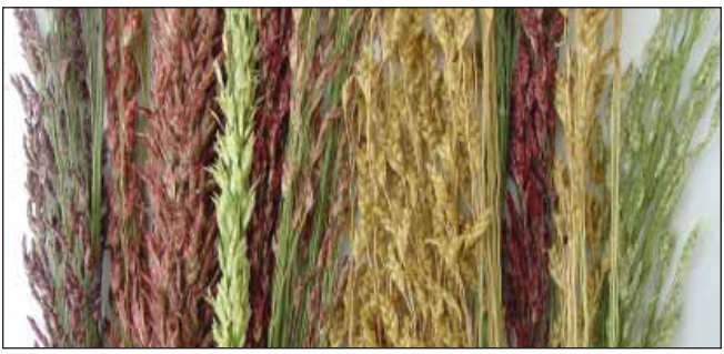
Teff seed heads showing the genetic diversity of the crop worldwide

The word "tef" is derived from the Ethio-Semitic root "tff", which means "lost", possibly a reference to its extremely small seed size.