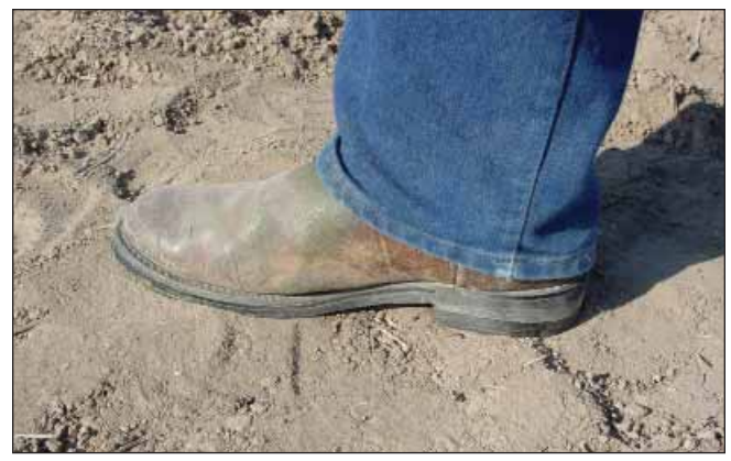
Proper seed bed preparation