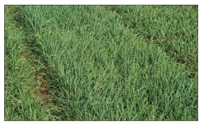
Seeding with no herbicide applied

If weed control is needed during stand establishment, several management practices can be useful. A pre-plant cultivation can be effective, especially if Teff is planted immediately after cultivation.