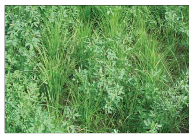
Teff interseeded into alfalfa