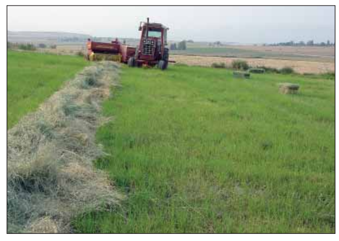
Windrows of Teff and note fast recovery after cutting

Harvest as dry hay will maximize forage production and return per acre. Hay making can be accomplished using normal harvest equipment for grass hay, however rotary mowers are preferred. Due to the fineness of its stems, Teff is one of the few annual forage crops that is suitable for making dry bales rather than having to ensile it. Windrows should not be left in the field for extended times since plants under the windrow may be damaged by delayed harvest.