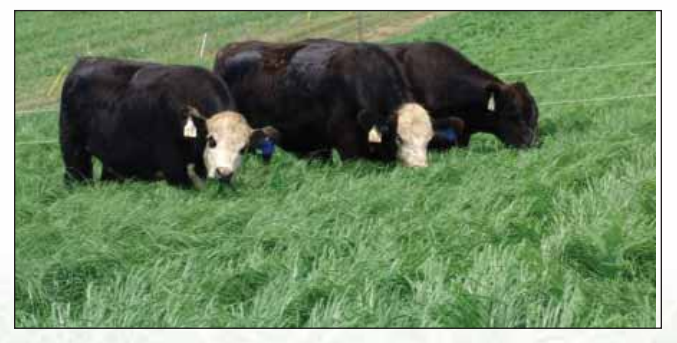
Cattle grazing in Teff

Grazing Teff planted in sandy soils may be more difficult than in heavier soils since plants are easier to pull out of sandy ground. In those cases, harvesting for hay might be advised in the early season and grazing after the last cutting. Prussic acid or nitrate toxicity in Teff forage has not been observed on late season grazing or after a frost.