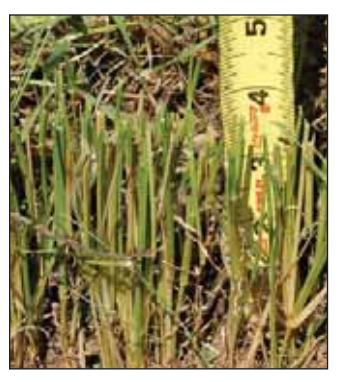
Proper cutting height

Cutting at the proper time (prior to seed head appearance) ensures adequate plant reserves for regrowth in subsequent cuts. Harvesting after Teff has headed out will cause delays in regrowth. Cutting interval is generally 45 to 50 days for first cut and approximately 30 days for subsequent cuts; however this may vary by location. A stubble cutting height of 3 to 4 inches is necessary to promote vigorous regrowth. Plant food reserves that fuel regrowth are stored in the bottom 4 inches of the plant stem, therefore cutting heights lower than 3 to 4 inches will severely reduce subsequent forage production. Windrows should not be left in field for extended times, or stand loss will occur under the windrows.