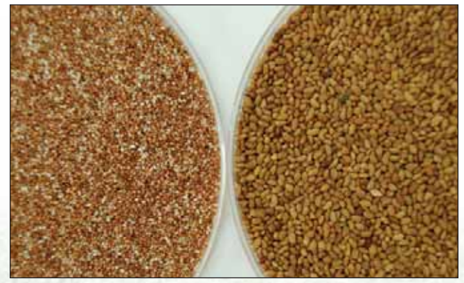
Raw Teff seed on the left at 1.3 million seeds per pound and alfalfa seed on the right with 220,000 seeds per pound.

Teff is a very small seeded annual grass with an average of 1.3 million seeds per pound. For this reason coated seed is usually preferred by growers so most planting equipment can handle Teff seed. Some seed coatings are now colored, which aids growers to visually check for coverage and depth of planting.