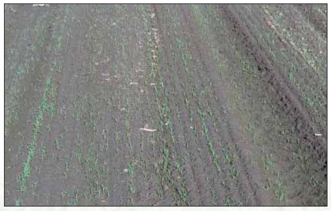
Uneven emergence due to a loose seed bed at planting

Planting Teff in a firm seed bed helps in proper seed placement and reduces the chance of burying the seed too deeply with loose soil. It also provides good seed to soil contact allowing for better soil moisture movement to the seed. Teff plantings in loose seed beds can often be identified by quicker seedling emergence in the wheel tracks of the planter, than in the rest of the field.