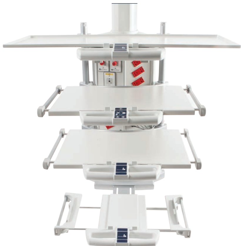
TELETOM 6 Series