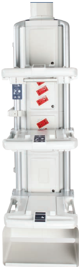
TELETOM 4 Series

Ideal for operating rooms with limited space, the TELETOM 4 Series is an excellent choice for multiple-boom surgical suites, as well as a more efficient alternative boom dedicated to robotic equipment. Plus, this innovative system provides all the features, benefits and options of the TELETOM 6 Series, so your team won't have to sacrifice capability or performance in the name of efficiency.