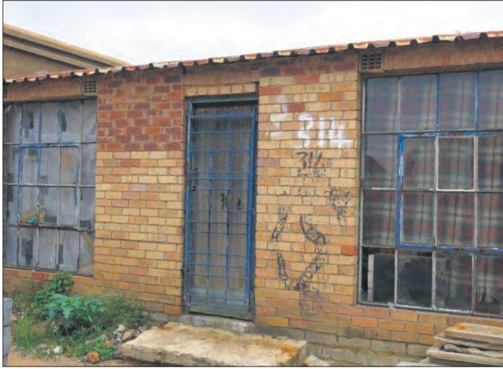
The house where the murder was committed.