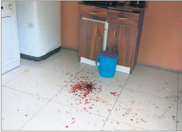
Bloodstains found in the house where the murder was committed.