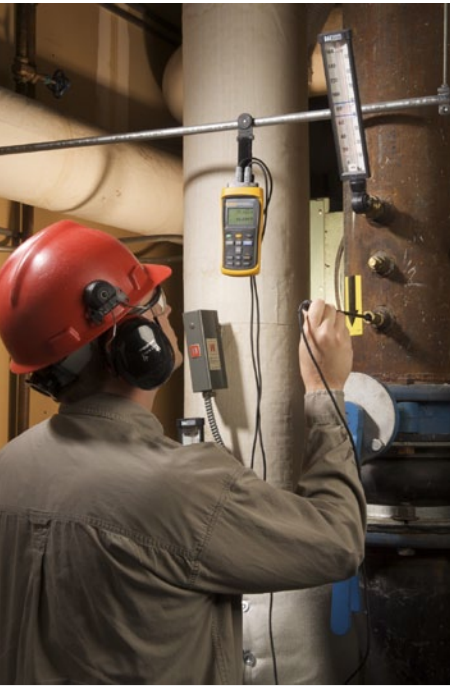
Use two probes and the 1524 to read, log, graph, and calibrate twice as much. \,