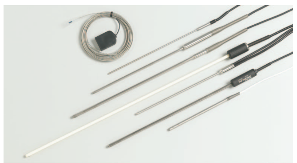
Caption to go here