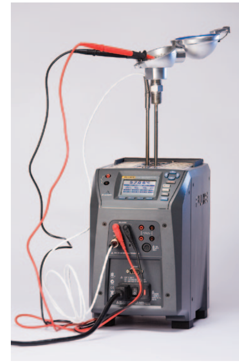
The 914X-P can act as the indicator for transmitters, thermocouples and RTDs and even a reference PRT to improve accuracy.