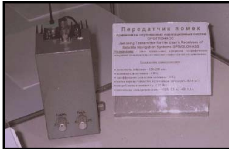
Figure 3. Aviaconversia Commercial GPS Jammer

access to the GPS timing signal that modern military and commercial digital networks increasingly rely upon to integrate and synchronize communications and information.