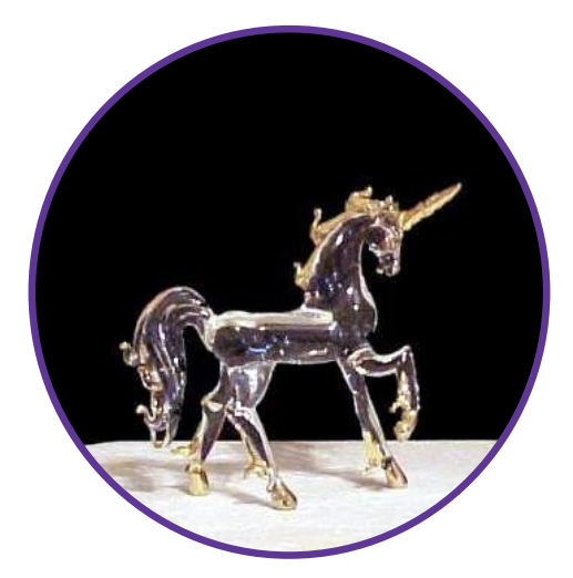
Glass Unicorn by Joe Silver.

that reminds the audience that they are watching a play. A common tool in meta-theatre is the use of a play-withina-play. In a sense, Tom's memories are a