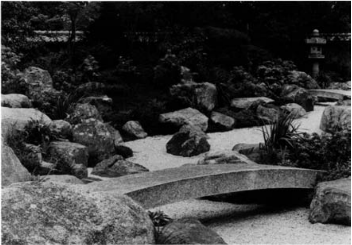
One of the curved bridges which link the “islands” to the “mainland.”

to roughen the texture. The base band is of granite from Deer Isle, Maine, resembling the facade of the museum’s West Wing.