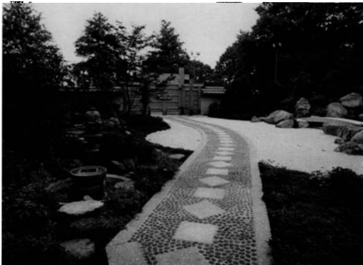
Looking along the curved path towards the gate at Tenshin-en.

between natural materials and human objects and arrangements.