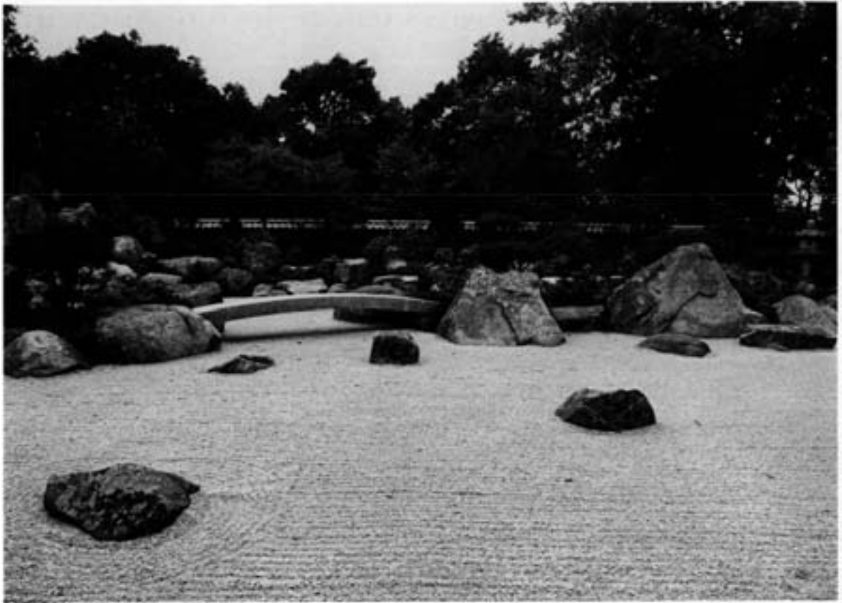
The crushed gravel “sea” at Tenshin-en. Raking gives the effect of ripples on the water’s surface.

of the West Wing of the Museum of Fine Arts, Boston. Completed in 1988, the garden is named in honor of one of the museum’s first curators of Asiatic Art—Okakura Kakuzo, also known as Okakura Tenshin.