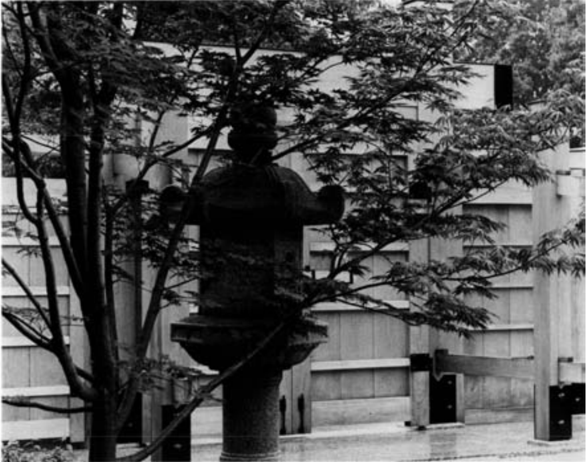
Stone lanterns are used to light paths and highlight special areas of the garden's design.

bloom suddenly and abundantly, but are gone nearly overnight, suggesting a good way to face death as well.