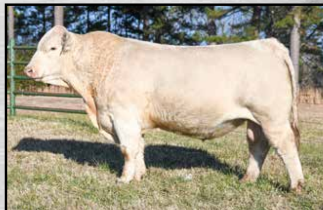
SAT Boomtown 8303 P ET ◆ The sire of Lots 39, 40 & 41

You're going to like what you see in these Boomtown daughters. SAT Boomtown 8303 P ET topped our 2019 Bull Sale at $34,000 for one-half interest to Full Circle Cattle and Lindskov-Thiel. This heifers dam, a Hankins Farms bred female also sells as Lot 16 in this sale.