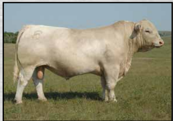
LHD Choteau B1669 P ♦♦ Sire of Lots 26 & 29

A moderate, broody replacement female that looks like the production kind that will just get the job done. Her sire Choteau is also the sire of LT Authority and an outcross to many of the Satterfield females. She sells bred AI to a top calving-ease herd sire prospect.