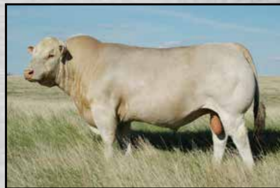
LT Ledger 0332 P ◆ Sire of Lot 2 & 3