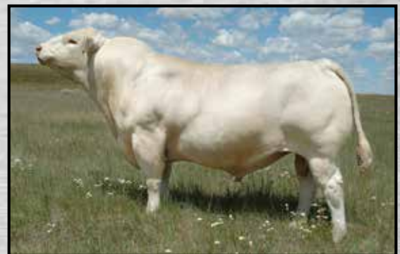
LT Tioga 4090 Pld ♦♦ Service sire to Lot 10

Presented by Rathmourne Charolais, Port Hope, Michigan