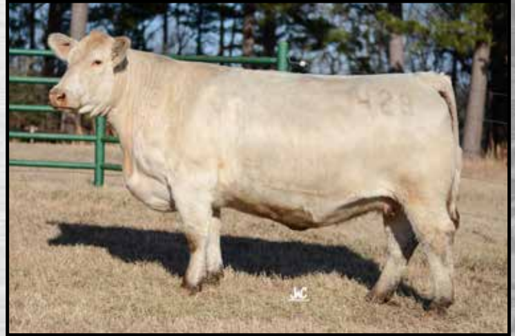
M6 Ms Jewel 428 P

Lot 24A ♦ Recip #6118 Due to calve November 3, 2021 LT Authority 7229 Pld x M6 Ms Jewel 428 P