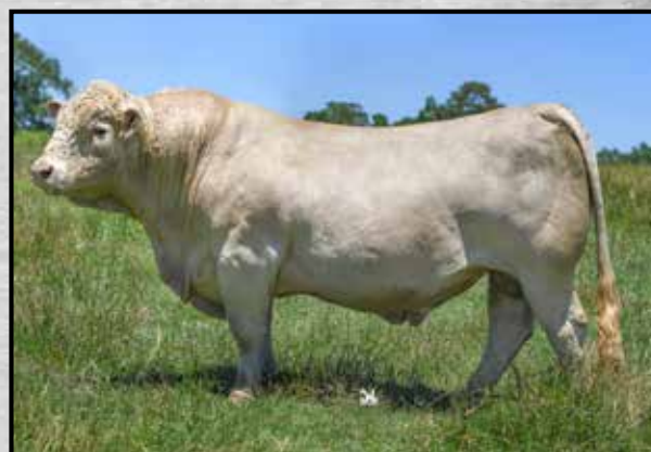
SAT Gridmaker 6306 P ET ♦♦ Service sire to all spring calving cows

One of Grid Makers very best sons. He sold for $27,000 to Broberg Charolais in Nebraska and to Link Charolais in Texas. His sons have been topping their sales including Satterfield's this past spring at $20,000 – SAT Profitmaker, Reference Sire B in this offering.