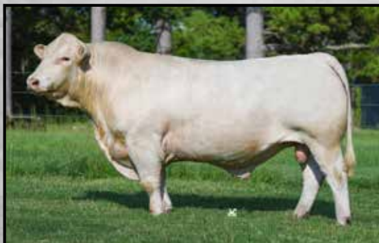
SAT Cornerstone 4234 P ◆ Sire of Lot 7A