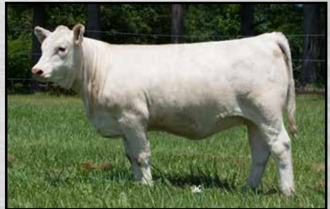
SAT Ms Elvira 6309 P ET ◆ Dam of Lot 35

Presented with J&J Trust, Parkston, South Dakota