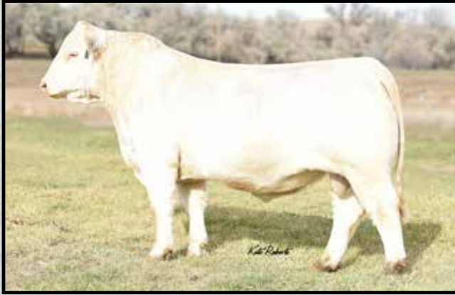
LT Authority 7229 Pld