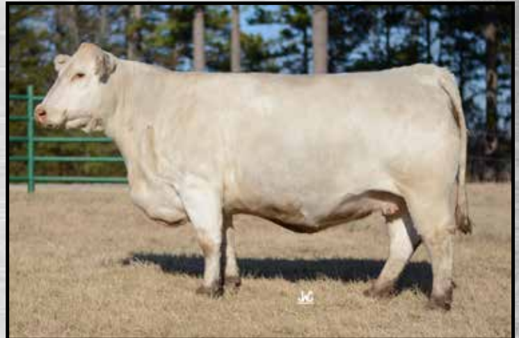
Reinharts Ms New Nancy 323E

Lot 24E ♦ Recip #5449 Due to calve November 1, 2021 LT Affinity 6221 Pld x Reinharts Ms New Nancy 323E