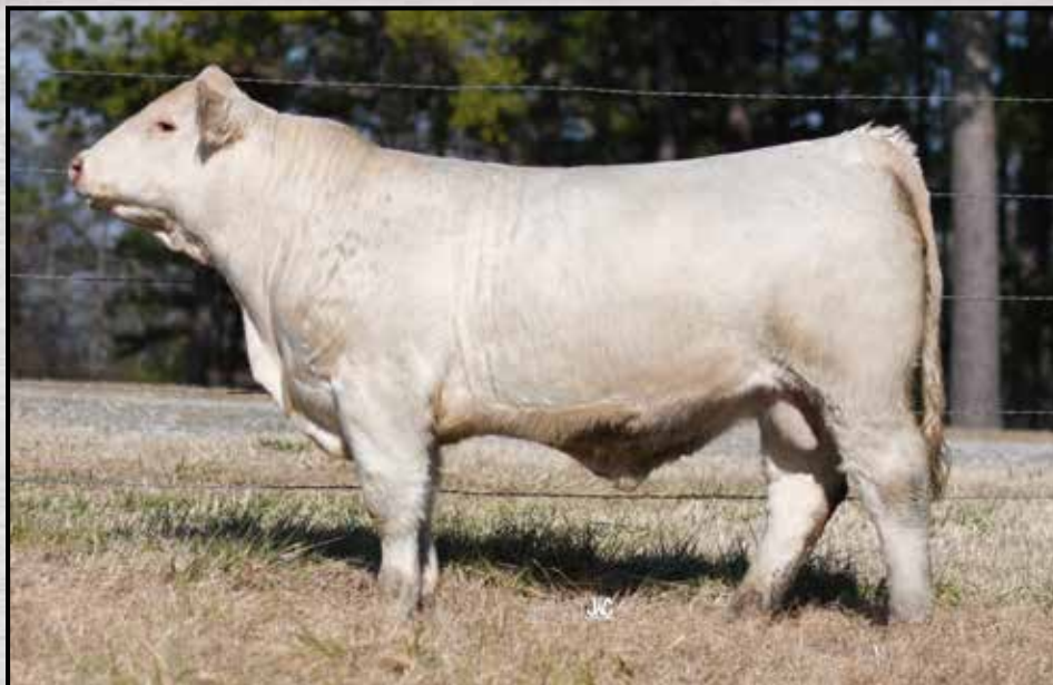
SAT Momentum 9303 P ET ♦ This LT Authority 7229 son is the sire of both Lots 4A & 5A.