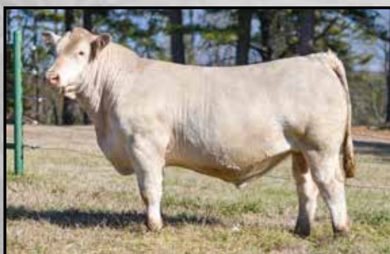
SAT Patriot 8029 P ♦♦ Son of Lot 18

There is going to be quite a few breeder's eyeball this nice younger female that could certainly be a future donor prospect! She was Mark's selection out of the Wild Indian Acres production sale. She is extremely beautiful in the pasture, moderate and great udder. Her EPDs are to say the least as impressive. She ranks in the top 20% of the breed for both CE & BW, in the top 15% for both WW & YW, top 15% for REA, top 30% for MARB and top 15% for TSI! These LT Ledger daughters keep coming to the top and this one has even more genetics to back her up. She is an ET out of the impressive Creek Cut Greta 576 donor, who's dam was another power donor after being selected the Reserve National Champion Female. Her equally impressive Resource daughter will stay right here at SAT. Mated to SAT Gridmaker 6306 could be deadly!