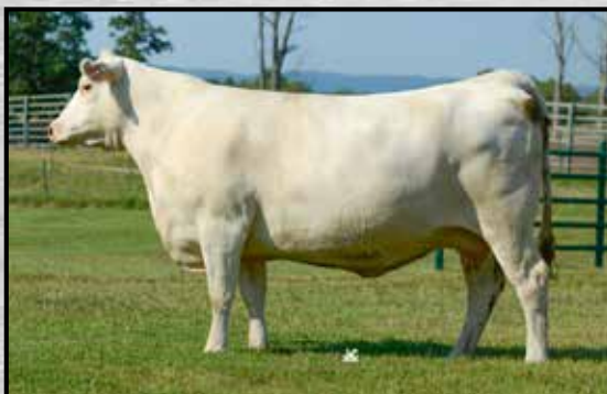
Eatons Brusset 10722 Polled ♦♦ Dam of Lot 23

A well-made, thick, square hipped, easy keeping female here that is an outcross on the top side of her pedigree being out of the famous M6 breeding program in Texas, but still having the dependable LT Bridger 9191 daughter on the bottom along with more SF - Satterfield Farms cow power to boot. Then turn to her power performance EPDs where she ranks in the top of the breed with these numbers; top 15% for WW, 20% for YW, 25% for MTL, REA & MARB in the top 35% of the breed and top 20% for TSI. Her 2018 daughter sired by RBM Fargo Y111 was a high performing female coming in with an adjusted weaning weight ratio of 111 and remains in the herd to keep these genetics in the herd.