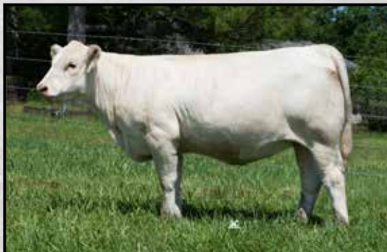
M6 Ms New Patriot 6154 P