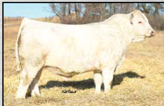
LT Remington 0038 Pld ♦♦ AI Service Sire for Lots 25, 26 & 27