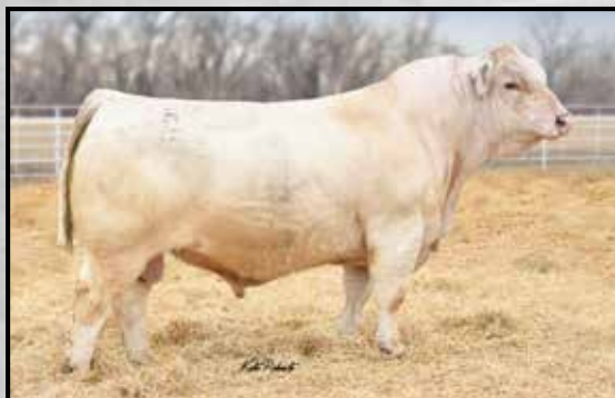
RBM Fargo Y111 ◆ Sire of both Lots 31 & 32

Presented by Reinhart Charolais, Paragould, Arkansas