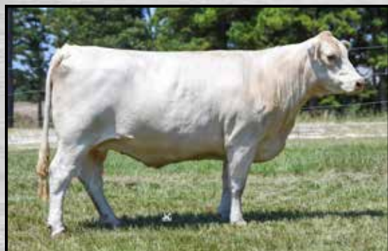
SC Ms Dutchess 4304 ♦♦ Dam of Lot 26

A big, powerful, long-spined female that will spin the head on many a breeder attending the sale. LT Authority 7229 is putting some great females into the pastures around the country. Mark doesn't let too many of these Sweetheart bred females go before they hit the six-year-old date to go into the sale. She was one of the highest performing heifers in her contemporary group with a 113 AWW ratio. LT Remington 0038 Pld was highly sought after during the 2021 Lindskov-Thiel Bull Sale as a calving ease sire with his 13.5 Calving Ease EPD and his -5.9 BW EPD that ranks in the top 1% of the breed for that trait. He sold for $27,000 to our friends at Full Circle Cattle Company.