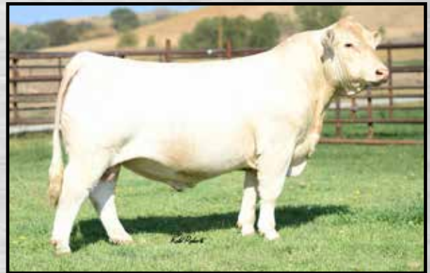
LT Badge 9154 Pld ♦ Service Sire for Lot 20