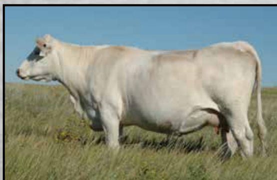
LT Carol 4105 Pld ♦ Dam of Lot 3

Another great LT Ledger daughter and this one is out of LT Bridger 9191's dam! They only flushed her one time with the embryos selling to Lindskov-Thiel. She has done one heck of a job here at Satterfield Charolais with big performance progeny because she has an abundance of milk flow. One daughter has sold to C&C Farms and another daughter sold to Lindskov-Thiel and another high-end daughter has been retained to carry on with these power genetics. This female will raise you one great set of ETs or one great one at a time. Satterfield Charolais will retain a 1/3 interest in this promising herd sire prospect.