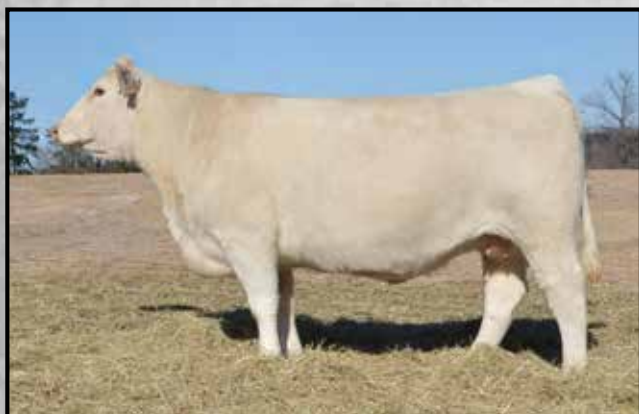
Fink Miss 8891 5784 GM P ◆ Dam of Lot 14