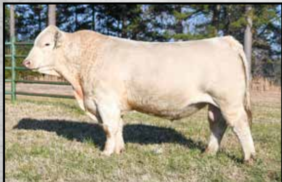
SAT Boomtown 8303 P ET

Presented by Reinhart Charolais, Paragould, Arkansas