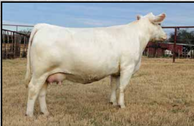
M6 Ms New Germaine 484 P ♦♦ Maternal granddam of Lot 39