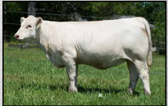
M6 Ms New Patriot 6154 P ♦♦ Dam of Lot 39