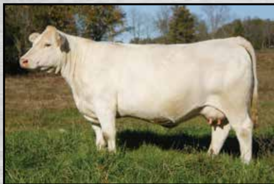
OW Ashlee 0063 P ET ◆ Dam of Lot 2

Satterfield Charolais will retain a 1/3 interest in this promising herd sire prospect.