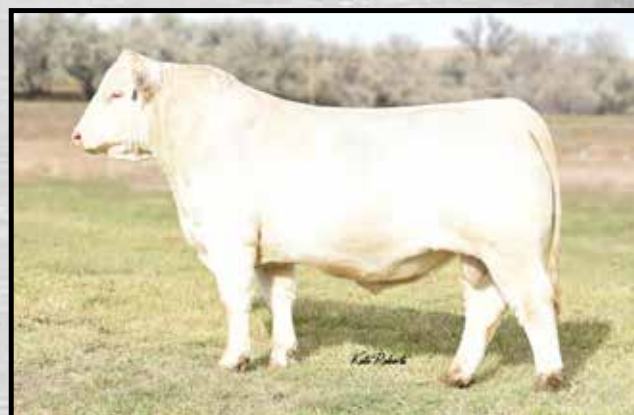
LT Authority 7229 Pld ♦♦ Sire of Lots 35 & 37