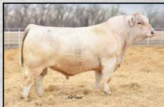
RBM Fargo Y111 ♦ Sire of Lot 4