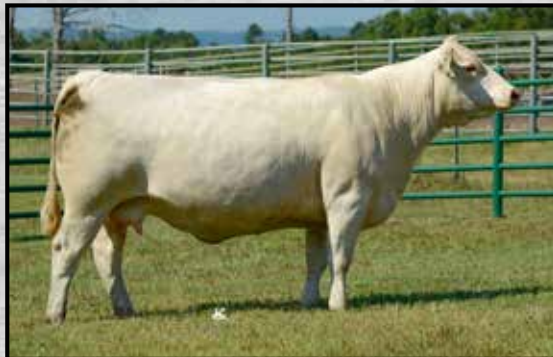
SF Miss Snowqueen 1114 P ♦ Dam of Lot 9

Here is a feminine fronted solid producer that is heavy milking and raised a great herd sire for T & L Charolais. Her calving interval has been nice: 4-1-18, 3-2-19, 3-23-20 & 2-21-21. One of her daughters has been retained as a replacement for her. These LT Sundance daughters have certainly been good for Satterfield Charolais and Lindskov-Thiel Charolais.