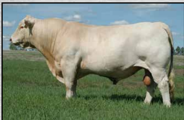
LT Bridger 9191 Pld ♦♦ Sire of Lot 12