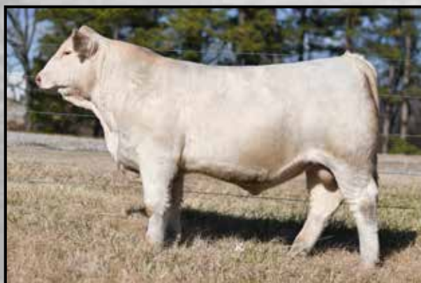
SAT President 9304 P ET ◆ Pasture service sire for Lots 20 & 21

Presented by Link Charolais, Center, Texas