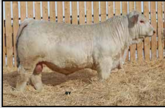
Elder's Houlio 4H