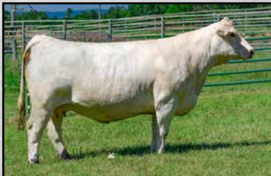
SF Ms Sweetheart 3112 P