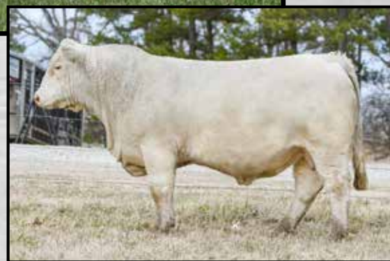
SAT Authority 9049 P ♦♦ Son of Lot 11