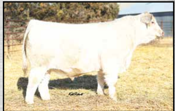
LT Concorde 0426 Pld ♦ AI Service Sire for Lots 28, 29 & 30