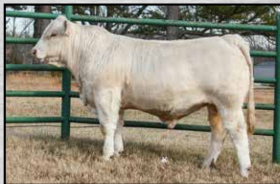
SAT Landmark 7309 P ET ◆ Sire of Lots 33 & 34

Presented by Reinhart Charolais, Paragould, Arkansas