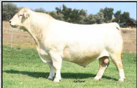
LT Inception 7456 Pld ET

Presented by Reinhart Charolais, Paragould, Arkansas