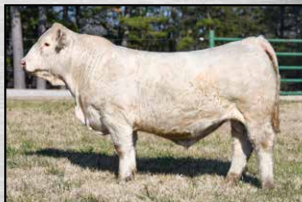
SAT Profitmaker 0203 P ♦ Service sire to all spring calving cows