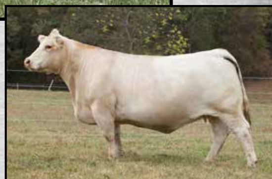
Creek Cut Greta 576P ET ♦♦ Dam of Lot 17