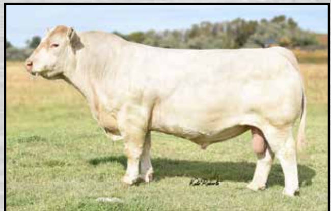
LT Patriot 4004 Pld