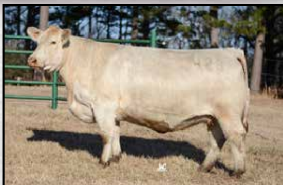
M6 Ms Jewel 428 P