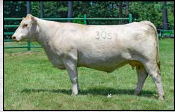
SF Ms 452D 3057 P