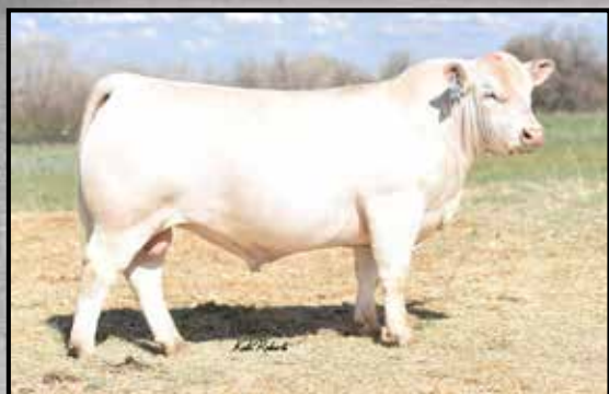
PVF Ridge 7142