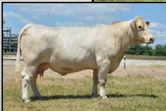
Swan Sweetheart M205 ET ♦♦ Dam of Lot 1

Pasture exposed from 4-15-21 to 6-17-21 to SAT Gridmaker 6306 P ET & from 7-8-21 to sale day to SAT Profitmaker 0203 P.