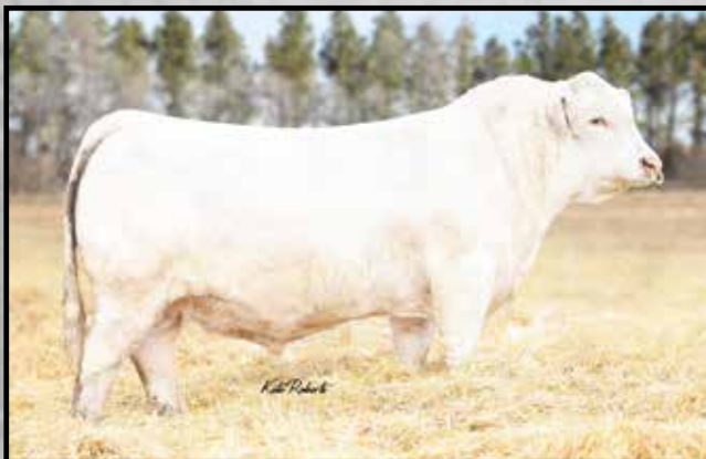
LT Affinity 6221 Pld

Presented by Bowen Farms, Bentonville, Arkansas