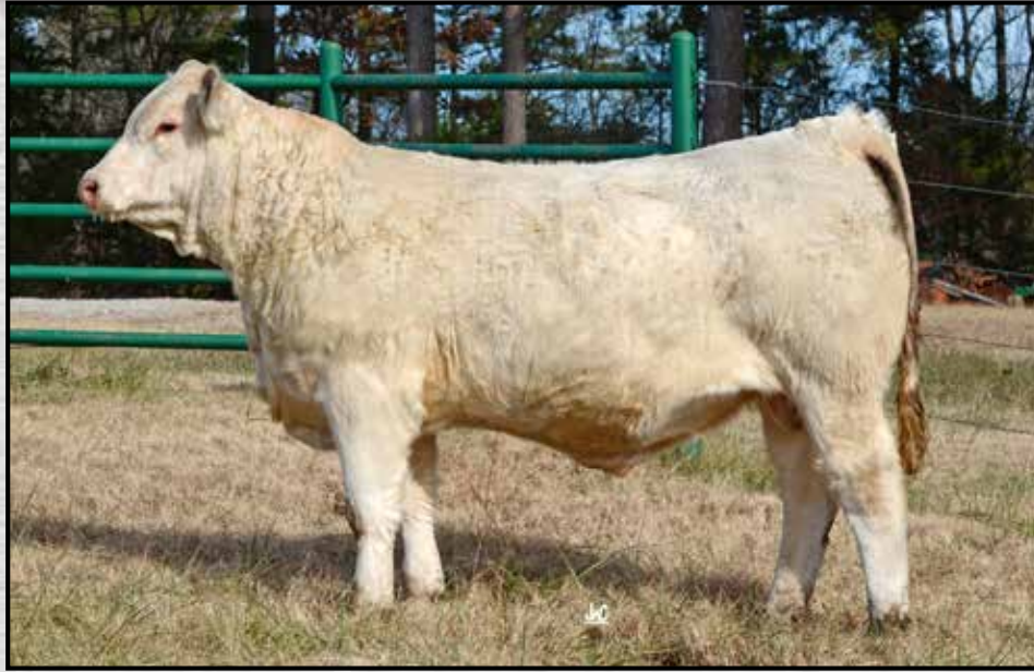
SAT Liberty 6209 P ♦ Sire of Lots 8A & 9A