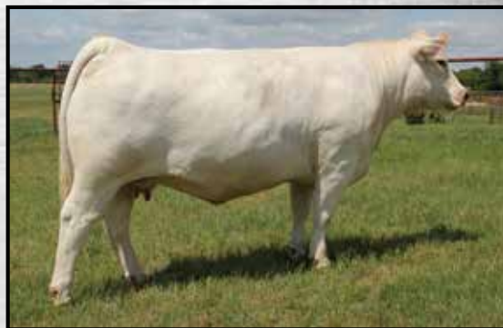
M6 Ms New Elvira 1134 P ET ◆ Dam of both Lots 31 & 32

This is quite a pair of full ET sisters. They are sired by the high performing RBM Fargo that is putting more weaning and yearling weight into his offspring. Therefore, the high weaning and yearling EPDs that rank them in the top 6% for the breed for WW and in the top 4% for YW and that pushes them into the top 7% for TSI. Their dam has produced ETs in the herds of M6, Satterfield, Reinhart, Sellhorst and Lindskov-Thiel. Their maternal granddam OBG Elvira 4303 has been selling high dollar progeny across the United States.