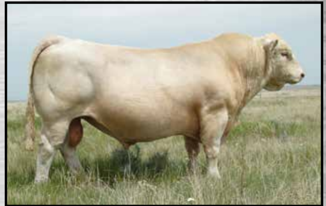
LT Blue Value 7903 ET ♦♦ Sire of Lot 10