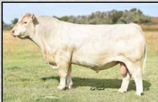
LT Patriot 4004 Pld ♦ Sire of Lot 5

Mark always puts a few younger females in the sale every year besides all the six-year-olds and this is one of them. He always whines that he shouldn't let them go, but here is one of them. This one comes out of the LT Carol 4105 cow family and of course she was the dam of LT Bridger 9191, a long-time fixture in this herd. She has all the look and numbers to go out and be a donor. These Fargo daughters are making some kind of brood cows. This female ranks in the top 3% of the breed for WW EPD, the top 1% for YW, the top 9% for MTL, top 15% for REA and the top 2% for TSI. Mark will retain one successful flush at the buyer's convenience, so you know he doesn't want to lose the genetics here.