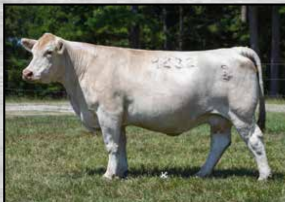
SAT Ms 452D 4232 P ♦♦ Dam of Lot 30