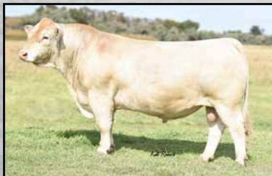
LT Landmark 5052 Pld ♦ Sire of Lot 28

Quite a nice pedigree tabulation here with Authority, Bells & Whistles, Ledger and Cigar. These Authority daughters are going to make some great milking brood cows when they calve for you this coming spring.