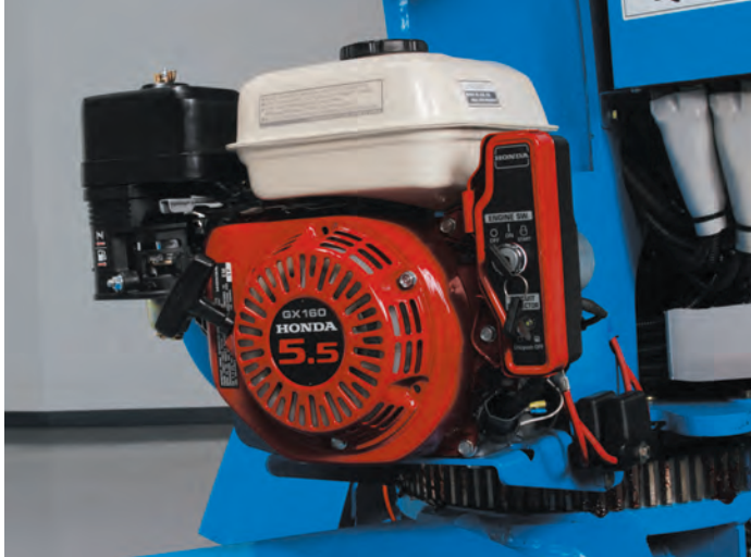
Hybrid DC/Petrol Engine

Allows machine to charge in remote locations.