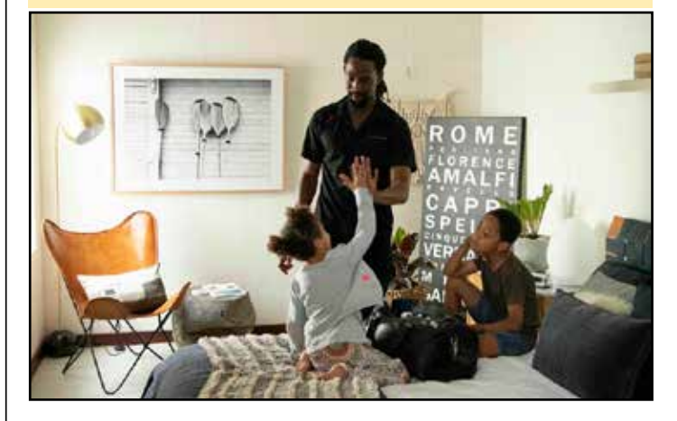
In November, our weekly tips aim to inspire and equip travelling dads.

This week, we're sharing some tips on how you can have fun while preparing your kids for your time apart. Try these tips to familiarise your children with the idea of you being away.