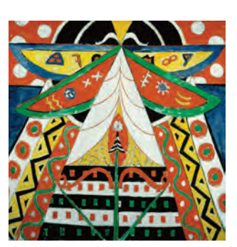
Marsden Hartley, Painting No. 50, 1914-15.

egg tempera on gesso hardboard 22 7/8 x 17 7/8 in. (58.1 x 45.4 cm); 1992.134