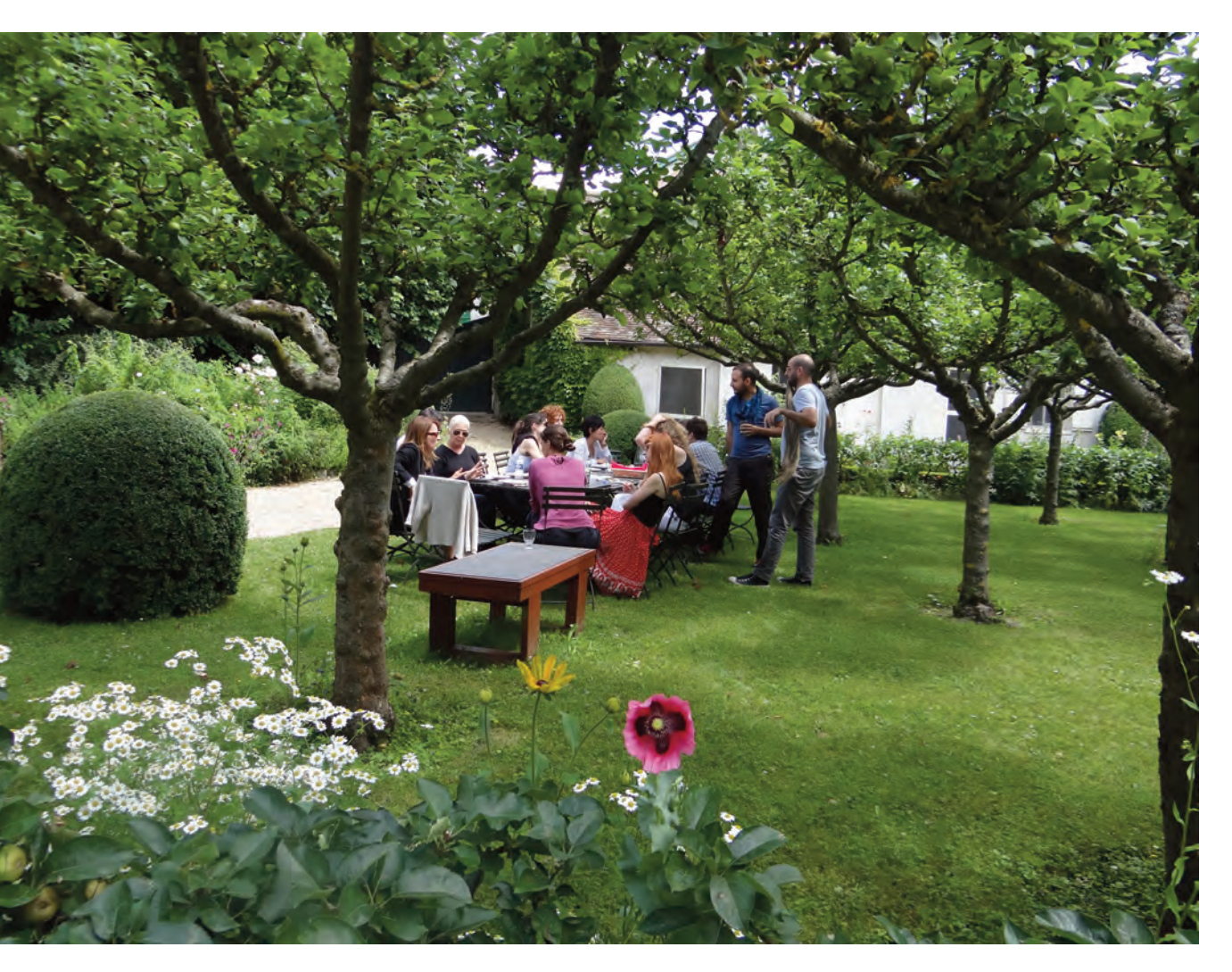
Terra Summer Residency fellows converse in the gardens during their eight-week stay in Giverny, France.

During the past two years, the Terra Foundation has continued to nurture a growing international network of American art academics and curators by sustaining support for several important fellowships and awards, as well as creating new opportunities for global inquiry and exchange.