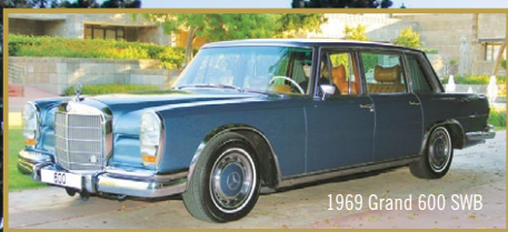
1969 Grand 600 SWB