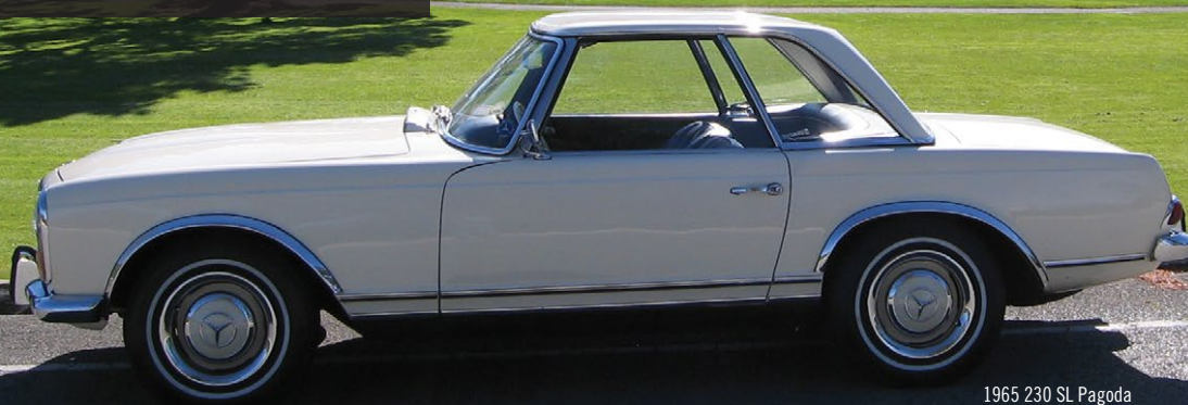
1965 230 SL Pagoda

All models and ages in clean condition welcome. Register your vehicle by July 31 at www.motorsportreg.com . Scroll to "August 16" then to "MBCA – Legends of the Autobahn."