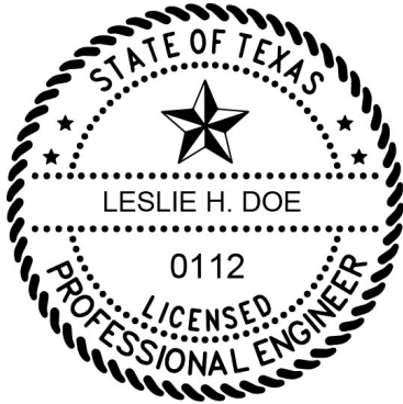
Figure: 22 TAC §137.31(c)