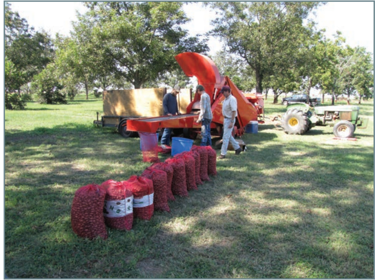
Figure 15. A pecan cleaner and sacking operation.