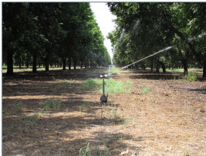
Figure 5. Solid set sprinkler irrigation.

Pollination: Pecan trees are pollinated by wind. The pollen is blown from male flowers called catkins to female flowers called