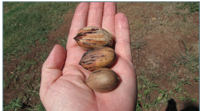
Figure 7. Nuts from three pecan varieties. From the top down: Lipan, Pawnee, and Kanza.

For more information about pecan varieties, see the Texas Pecan Handbook , which is available from the Texas A&M AgriLife Bookstore at https://agrilifebookstore.org/ .