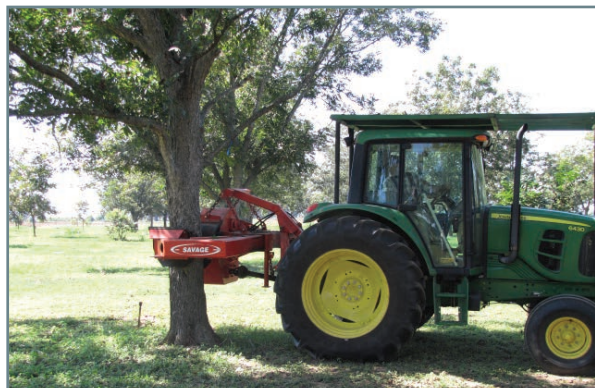
Figure 2. A powered trunk shaker.

Cash flow: Establishing a commercial pecan orchard requires a significant capital investment for the land, equipment, irrigation well, water delivery system, and other special needs like wildlife-proof fencing. Growers must have a cash flow plan for the 5- to 7-year establishment phase, when the trees bear very few pecans.