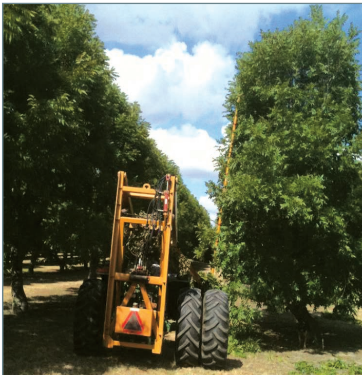
Figure 9. A mature orchard spaced at 30x30 feet, hedged annually to maintain sunlight.

Tree removal strategies differ somewhat for square, rectangular, and diamond orchard planting designs. For planting designs and