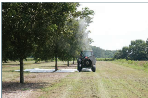
Figure 4. An air-blast pecan tree sprayer.

Equipment costs: Although hobby orchards of 1 or 2 acres may be harvested expediently enough by hand, larger endeavors need specialized harvest equipment. Commercial equipment includes tractors, shakers, harvesters, cleaners, and airblast tree sprayers (Figs. 2, 3, and 4).