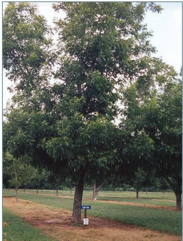
Figure 10. A “sod and strip” orchard floor.

Although some Texas growers graze sheep, cattle, goats, and other animals in improved orchards, it is generally not recommended because livestock can compact the soil, damage young trees, and interfere with irrigation, spraying, and harvesting.