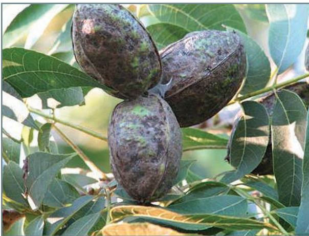
Figure 12. Pecan scab on pecan shuck.

Potassium and phosphorus: Potassium fertilizer may be needed every 1 to 3 years, especially on sandy soils. Phosphorous fertilizer is seldom needed in Texas, and applying it can aggravate other micronutrient deficiencies. Monitor both elements regularly through soil and leaf analysis.