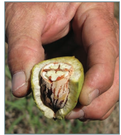
Figure 1. Improved pecan nuts are also called papershell pecans because of their thinner shells.