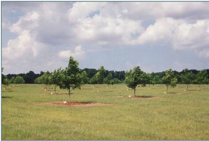
Figure 8. A well-spaced young pecan orchard.