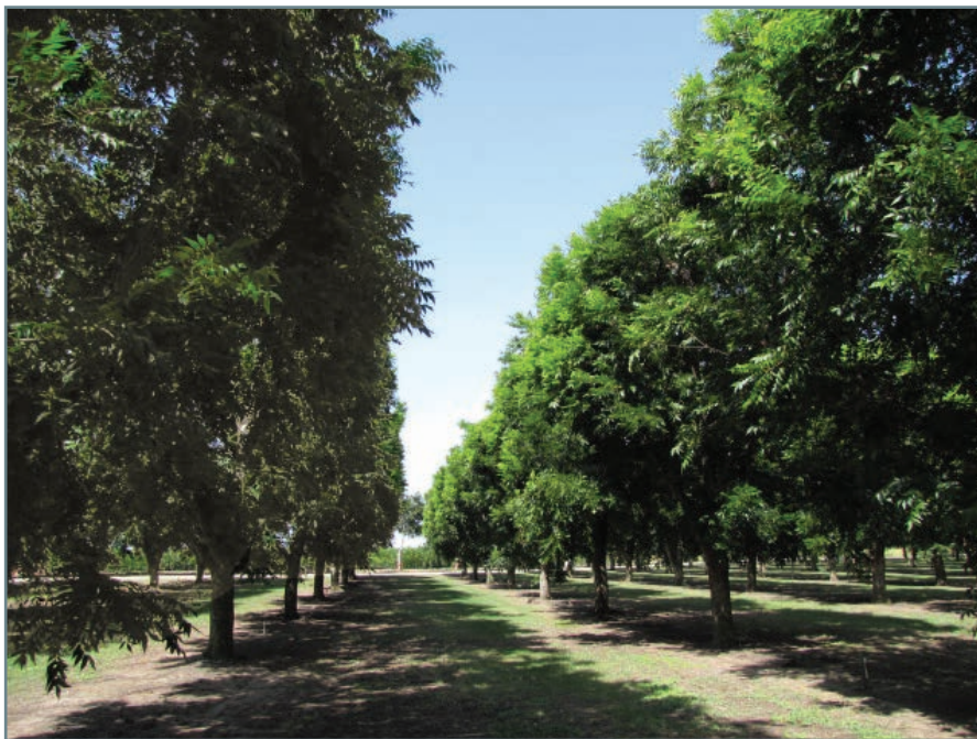
Figure 16. Well-managed pecan orchards on good sites can produce from 1,000 to 2,000 pounds of nuts per acre per year.

Well-managed orchards on good sites can produce from 1,000 to 2,000 pounds per acre per year (Fig. 16). Pecan production