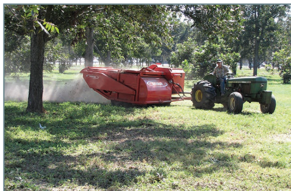
Figure 3. A powered pecan harvester.