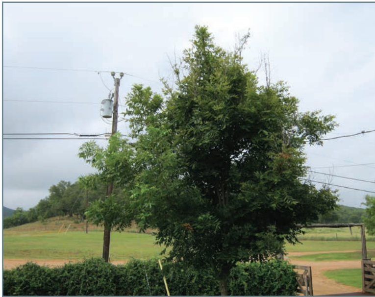
Figure 11. Severe zinc deficiency symptoms in pecan: bunched canopy, small leaves, and limb dieback.

Zinc: Foliar zinc sprays are essential for maximum leaf expansion and pecan growth (Fig. 11). Applying zinc to the soil or via drip systems is ineffective unless the soil pH is 6.0 or less and no limestone has been applied.