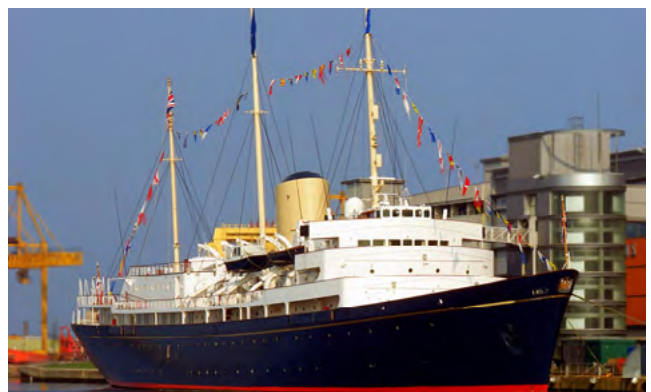
Royal Yacht Britannia