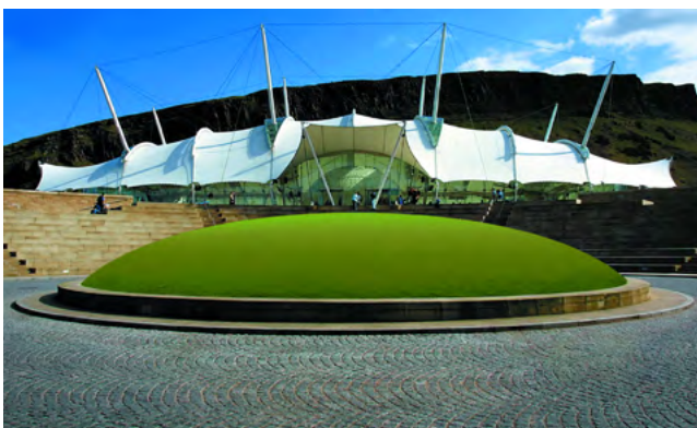
Our Dynamic Earth