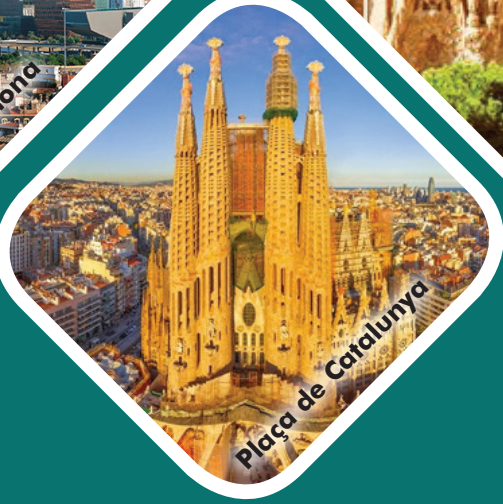
Plaça de Catalunya