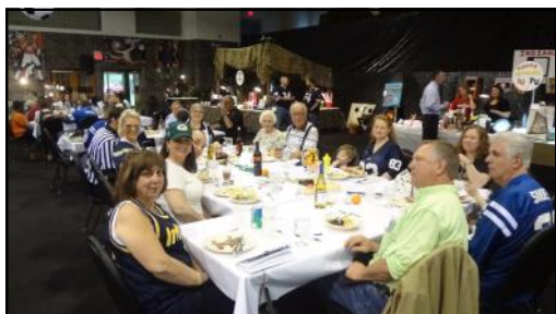
Guests at the 29 th Auction enjoyed an evening celebrating sports.

Attend the Auction: Talk with your classmates & make plans to return to your alma mater for an evening of fun together while supporting future students. Make it an evening out with friends. Tickets are $50 per person which includes appetizers, dinner, desserts, wine & $25 in scrip that may be used in the oral auction. Reservations are due no later than May 1, 2015. Note that Auction guest must be over 21 years of age.