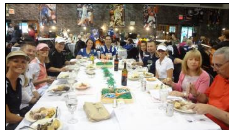
Delicious food served to guests at the 29 th Auction.

For more than 100 years, St. Paul Catholic School has carried on traditions of excellence in academics, fellowship, faith formation & more. One of the most cherished for the last 30 years is that of the annual Auction. Just like our school & community, the Auction has evolved over the years. At times there were family preview nights; some years guests dressed with the theme; other years called for formal attire. What has not changed is that the Auction remains a fun evening with a serious purpose: to raise funds for scholarships, to further friendships & to celebrate the excellence of our school - past, present & future.