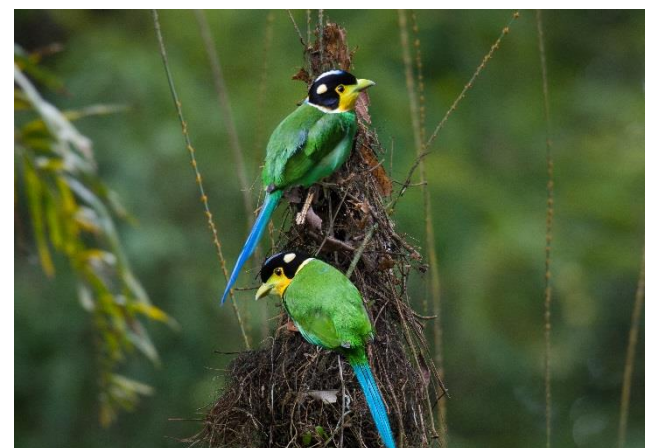
Great Hornbill, Spoon-billed Sandpiper, Long-tailed Broadbill