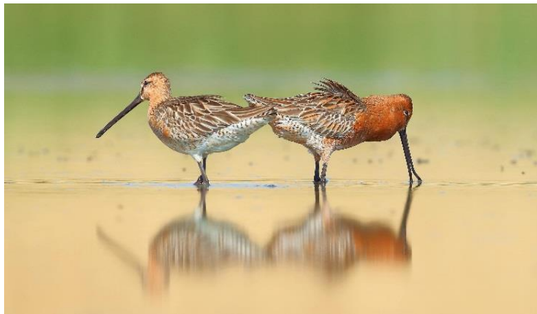
Asiatic Dowitcher ( Limnodromus semipalmatus )

The Spoon-billed Sandpiper migrates from its northern breeding range down the Pacific coast to its main wintering grounds in South and South-east Asia. Spoon-billed Sandpiper has been a regular wintering species at Phetchaburi in recent years and we will be hoping to find this small attractive bird - we'll keep a