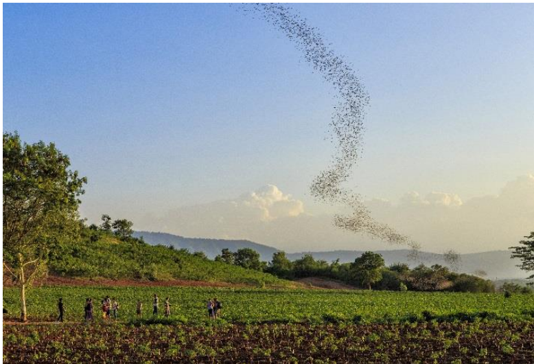
Wrinkle-lipped bats ( Chaerephon plicatus ) emergence

A surfaced road ascends to the highest point of the reserve at over 1,300 metres and from this a network of trails provides access to the forest. Some of these are no more than short tracks, while others can be explored for 10 kilometres or more through pristine jungle, following the course of rushing streams which tumble over picturesque waterfalls as they wind along the contours of the