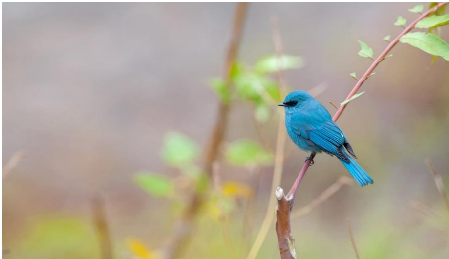
Verditer Flycatcher ( Eumyias thalassinus )

Join the Naturetrek e-mailing list and be the first to hear about new tours, additional departures and new dates, tour reports and special offers. Visit www.naturetrek.co.uk to sign up.