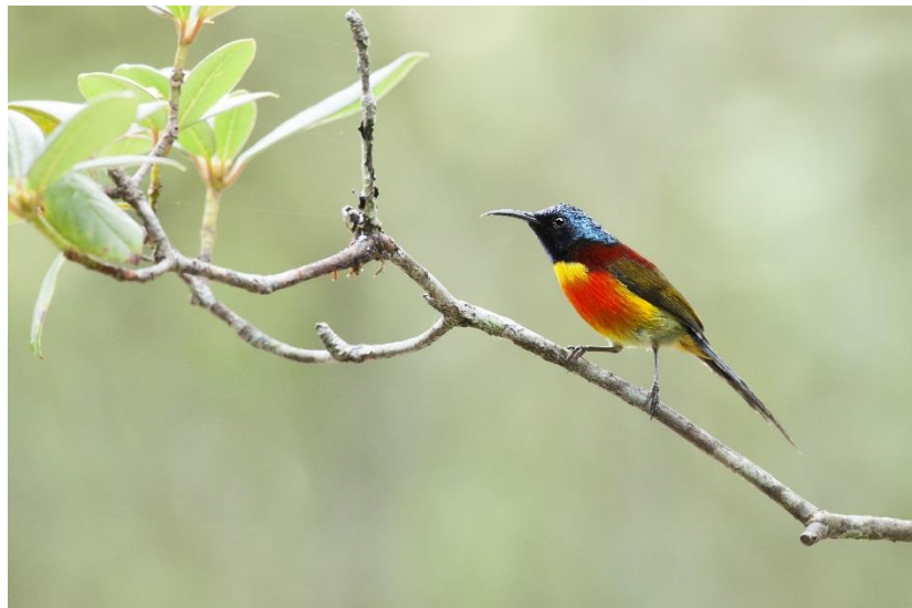
Green-tailed Sunbird ( Aethopyga nipalensis )

Khao Yai. Rufous-winged Fulvetta, Striated Yuhina, White-bellied Yuhina and Grey-headed Flycatcher are four typical members of these flocks, whilst associated species may include Lesser Racket-tailed Drongo, Grey-cheeked Nun-babbler, Rufous-fronted Tree-babbler, Red-billed Scimitar-babbler and Chestnut-fronted Shrike-babbler.