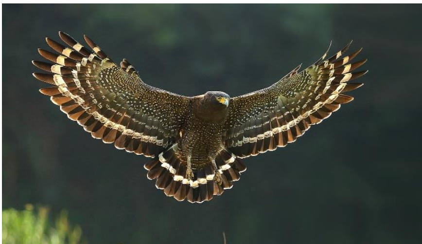
Crested Serpent-eagle ( Spilornis cheela )

Over 200 bird species have been recorded at Khao Yai, ensuring that even with the limited time at our disposal we are guaranteed a tremendous start to our Thailand holiday. Some of the residents are widely distributed throughout the reserve, others confined to particular elevations or habitats but among the birds we could hope to find are Red Jungle Fowl, Green-legged Tree-partridge, Crested Serpent-eagle, Thick-billed Green Pigeon, Green-billed Malkoha, Silver-breasted Broadbill, Banded Kingfisher, Indian Roller, Fairy Bluebird, White-rumped Shama, Olive-backed Pipit, Dark-necked Tailorbird, Red-headed and Orange-breasted Trogons, Black Eagle and Buff-bellied Flowerpecker to name just a few more of the possibilities. We will also try to find challenging species such Siamese Fireback, Silver Pheasant and Red-billed Ground Cuckoo, though these can prove elusive!