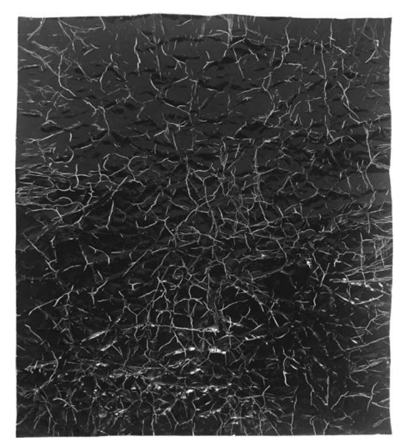
Figure 6. Joy Episalla, foldtogram 22 rc ( 20 \times 16 ), 2017. Unique Photogram, silver gelatin Illford multigrade glossy RC paper, 20 \times 16 \times 0.25 inches. Courtesy of the Artist.

contact that may retain not only likeness but also the confirming residue and extractable data of its contacts, the photogram is also embedded in the extractive economy of the image-as-data to be mined and accumulated that is crucial to the imagestream of global capital.