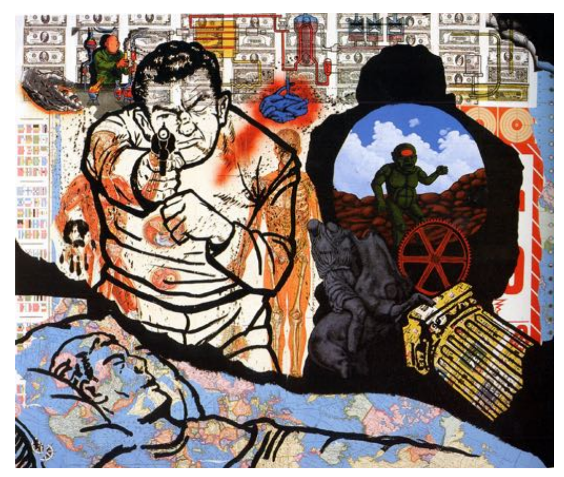
Figure 1. David Wojnarowicz, History Keeps Me Awake at Night , 1986. Acrylic, spray paint, and collage on masonite, 72 × 84 in (182.9 × 213.4 cm). Courtesy of the Estate of David Wojnarowicz and P·P·O·W, New York

that other side of keep, the keep on keeping on of struggle that wrests the unkept in the sense of the uncared for of history from tranquilizing historicization by mobilizing death against lethal disposability and the "queer fatalism" Sara Ahmed powerfully diagrams as the ruse by which the fatality that follows anti-black, anti-trans and homophobic violence is magically projected outward to re-appear as if it were its cause (Ahmed 2017).