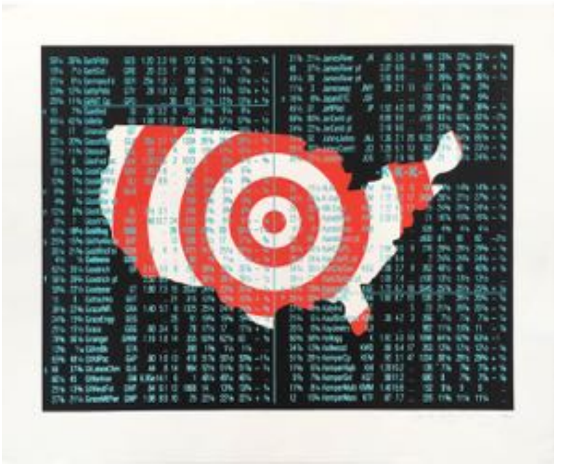
Figure 4. David Wojnarowicz, Untitled (for Act Up) , 1990. Silkscreen on paper, 22 1/2 \times 27 \frac{1}{2} inches (57.15 × 69.85 cm), Edition of 100.