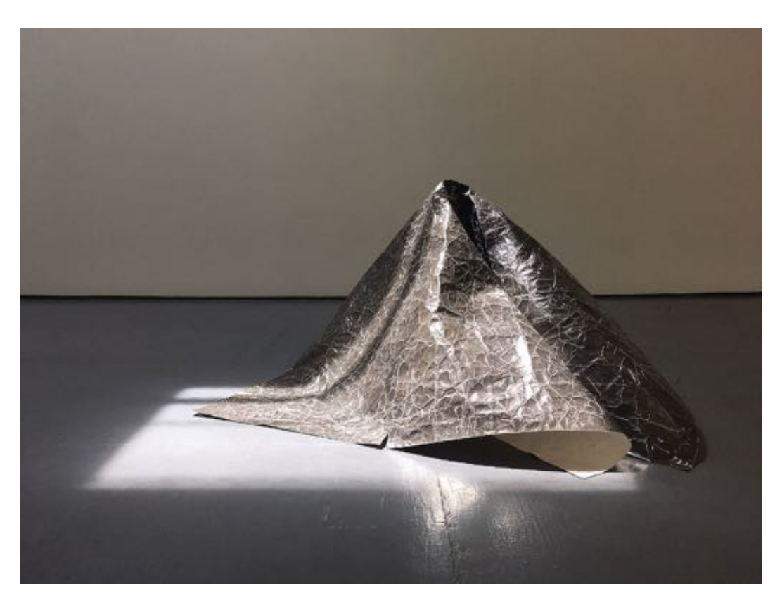
Figure 9. Joy Episalla, foldtogram ( lg\ rc\ black\ 63 \times 42 ), 2017/2019, site-specific installation view from The leaden circles dissolved in the air. Joy Episalla and Carrie Yamaoka, Transmitter Gallery, Brooklyn, New York, July 2019, unique photogram, silver gelatin multigrade matte RC paper. Dimensions of installation variable.

Through their refusal to bend to the technical rules of the capturing of impressions that still govern