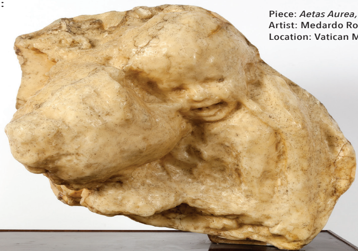
Piece: Aetas Aurea , 1886-1887 Artist: Medardo Rosso Location: Vatican Museums

How can I express greater tenderness toward my loving Father?