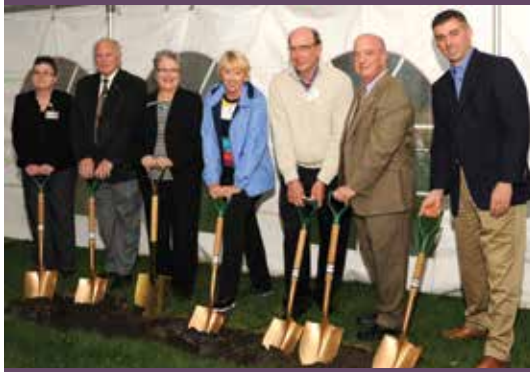
Dignitaries breaking ground for Building Tomorrow Campaign.

Celebrating our Past, Believing in our Future