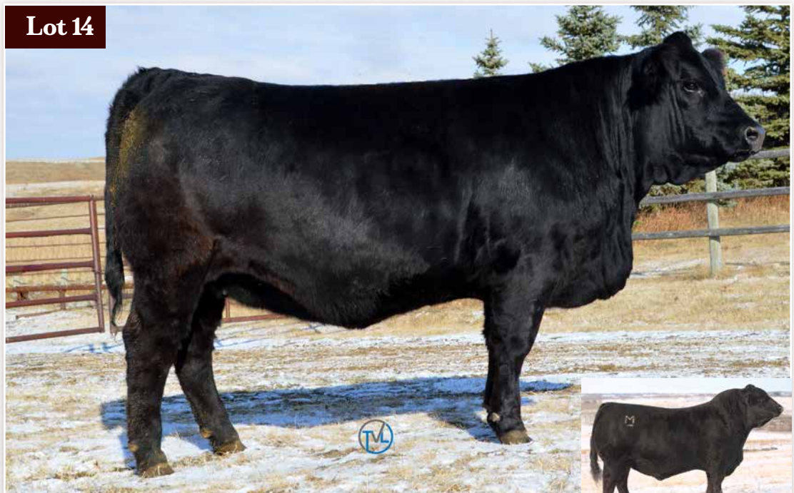
MADER THE NATIONAL 43E SIRE OF LOTS 13 & 14