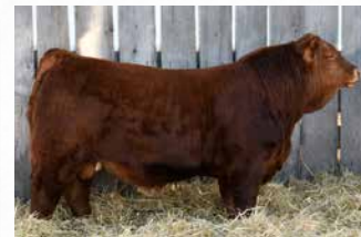
RAFT 616G $13,000 FULL BROTHER HIGH SELLER TO HAMAN FARM AND SIMMENTAL, NORTH DAKOTA