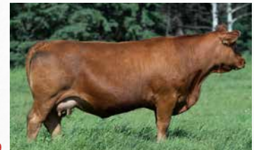
BEE LUSTER 553C DAM OF LOT 29

Exposed to PWK Cliffhanger 18C PG1139389 April 11 to May 25. Ultra-sounded safe to AI.