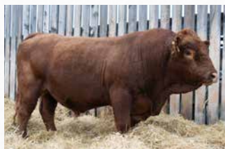
NUG EXCITER 221E SIRE OF LOTS 50-52

SATH Miss 34H is a full sister to a heifer we sold here last year to WJ Simmentals. She is long and extremely smooth in her build. Another "Exciter" heifer that is very easy to like, his daughters are getting ready to have their first calf and they continue to impress more and more each day. I can't wait to see what they do for us and everyone for years to come!