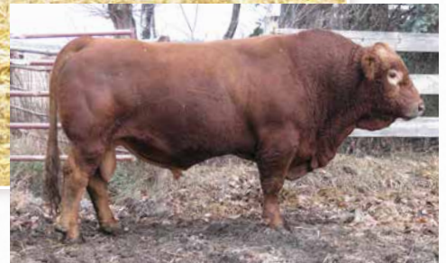
TYMARC DIGGER 416D SIRE OF LOTS 32 & 33