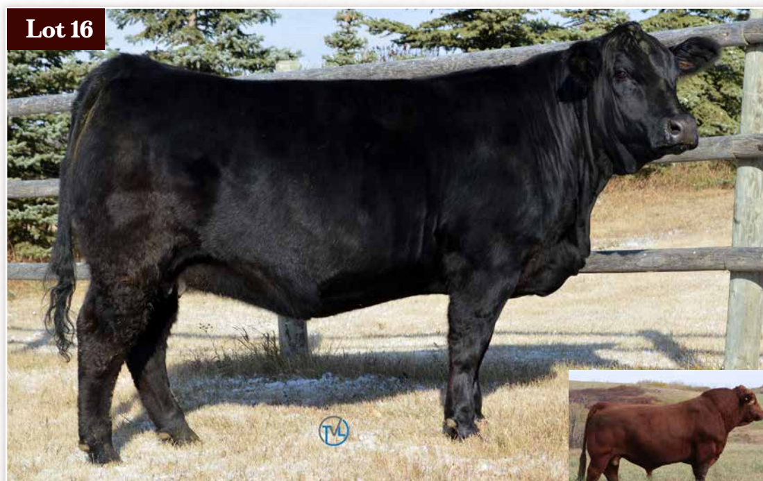
WHF LIMITLESS B011 SERVICE SIRE TO LOTS 14-16

City View Diva 32G is an exceptionally long bodied daughter of the popular Bounty Hunter with a picture perfect udder coming into shape. We can't say enough about the job Bounty Hunter has done making females in our herd and his sons were well received in our bull sale as calving ease prospects. Diva's dam was purchased through the Simmsational event and has matured into an attractive, well uddered mother cow. Diva is safe to Limitless and the results, red or black, will be homozygous polled by parentage and exciting!