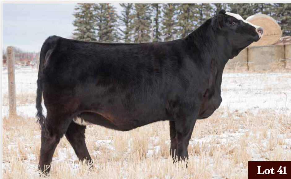
Bred April 6 to LKCC Bold Venture 194F. No exposure