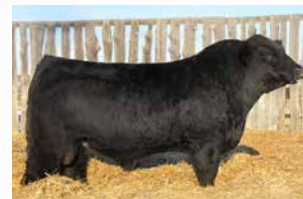
STEWART RAKE IT IN 14E SIRE OF LOTS 3, 8 & 9

Co-owned with M&S Cattle Co 22H is sired by the Profit son we had purchased from Stewart Cattle Co. at Checkers in 2017. Stewart Rake It In 14E has done a tremendous