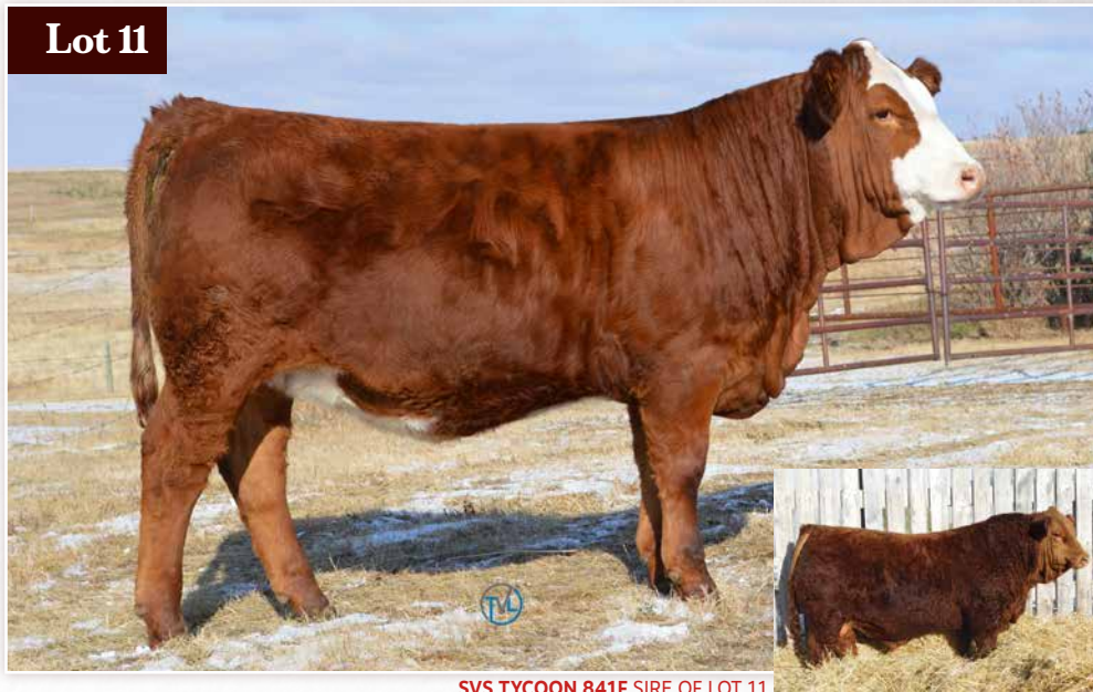
SVS TYCOON 841F SIRE OF LOT 11

City View Haley 32H ranks among the most exciting females we have offered to date. Direct from the first calf crop of the widely regarded Tycoon, this baldy female is elite in so many ways. Tycoon worked exceptionally well in our program and his first sons along with heifers in the replacement pen are highlights this fall. Her actual performance combined with a shot of fleck on the mother's side make her a slam dunk as a mother cow but her supremely attractive look add to her versatility as a show heifer as well. It's taken a lot of arm twisting for her to be here because the kids have been set on keeping her for themselves. Haley has an exemplary foot, is homozygous polled and is perfectly sound in structure and design. This is one we can't say enough things about and one we're sure to regret offering here for years to come.