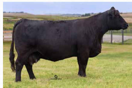
ANKONY MISS CANDACE U056 DAM OF LOT 53

NCB Cobra 47Y bred cows naturally until he was 13 years old and is steadily becoming a top EPD sire.