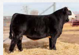
DOUBLE BAR D BANKROLL 449F SIRE OF LOT 47

A stout thick heifer that has a good temperament, like her Dam. We purchased FSCC 37H's Grand Dam at the D Bar C Dispersal and mated her to a Topcut son that we purchased from the Maxwell's to get FSCC 822Z. We have retained and or sold all the offspring that FSCC 822Z produced, male or female. We purchased FSCC 37H's Sire who was one of the Pen of 3, first place Champions at the National Western Stock Show in Denver. She has been palpated and has been cycling.