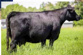
PF ZENYATTA RLP 3Z DAM OF LOT 38