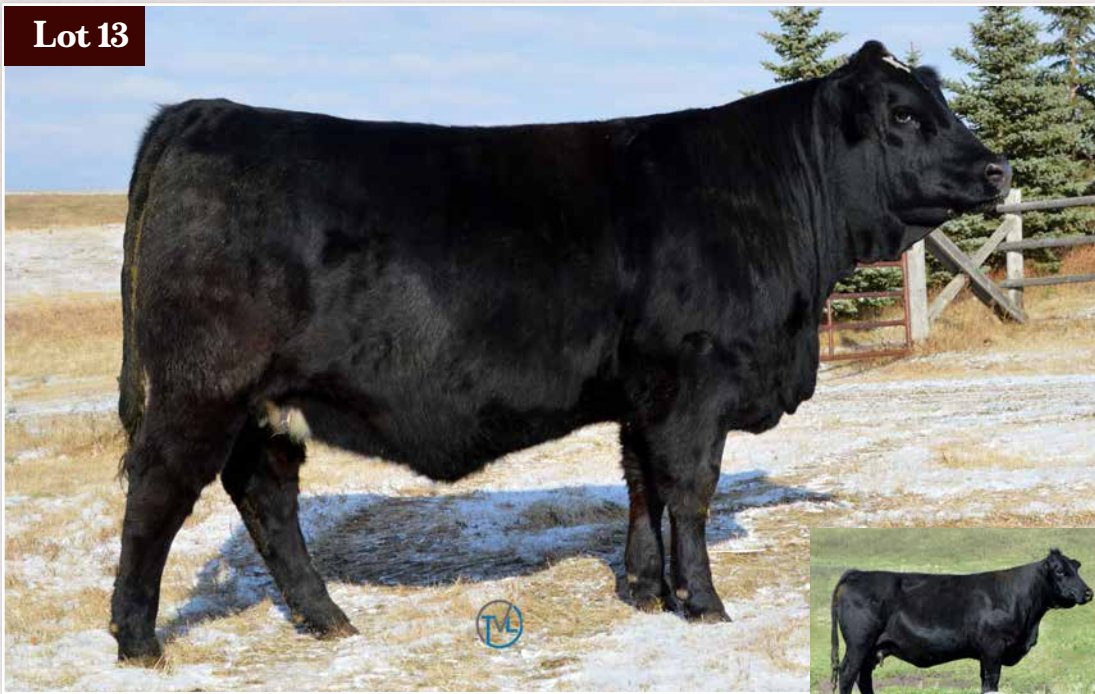
CITY VIEW 127T RAVEN 55Z GRAND DAM OF LOT 13

City View Raven 11G is a royally bred female with a world of future and one we simply can't say enough about. A direct daughter of the 2019 Agribition Reserve Champion bull, The National, Raven comes directly from our most cherished cow family. The Raven name is synonymous with big time cow power in our program and 11G is, without doubt, going to carry on that tradition. She is moderate framed, boldly constructed, has an attractive baldy face and a great disposition to boot. A maternal brother sold through our bull sale and a sister is in our replacement pen. Homozygous polled and black, she sells safe to our new red calving ease prospect, IPU Approval 101G for a February baby. City View Raven 11G will be easy to find sale day and a smart piece of business will be getting her bought.