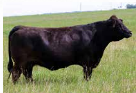
LFE BS HEAVEN SENT 89A DAM OF LOT 26

Smooth fronted, long, deep, and wide are just a few words to describe this Embryo calf. The Profit x LFE 89A combination hit a home run here. FSCC 23H is packed full of great pedigree. She has been palpated and has been cycling.