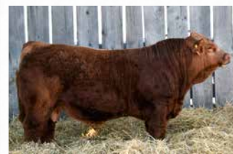
RAFT 111G $9500 FULL BROTHER HIGH SELLER TO KZ SIMMENTALS MAYERTHORPE AB