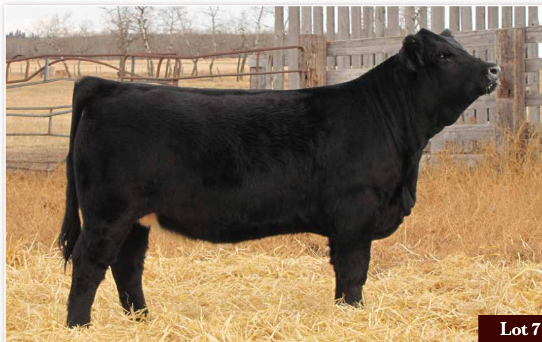
LOT 7 AT LLOYDMINSTER STOCKADE ROUND-UP

We have kept numerous females out of the 86U cow family and it's time we offer a daughter for sale! All of 86U's daughters and granddaughters boast immaculate udders. It's not often that 86U doesn't have progeny in our yearly show strings either. She's purely one of our most consistent producers!