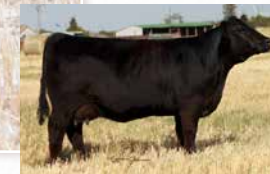
LKCC BOLD VENTURE 194F SIRE OF LOT 1 SMRT MS MOLLY 40F DAM OF LOT 1