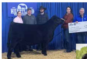
PF GLAMOUROUS RLP 10G MATERNAL SISTER TO LOT 38

Hollie 7H is a high volume big bodied, good footed powerhouse heifer calf. This is the type of female that will follow in her dam's shadow of longevity and performance. She had an actual weaning weight of 828lbs at the beginning of September and hasn't stepped off the breaks. 7H will make a great female in any herd, she is sure to raise some herd bulls!