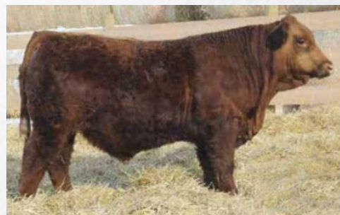
X-T RED MISSILE 154G SERVICE SIRE TO LOTS 27 & 28