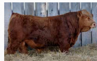
RAFTER 4T REDEMPTION 59F SIRE OF LOT 49

Homo Polled 23H is the first female being sold off our home raised herd sire Rafter 4T Redemption. Redemption was one of the