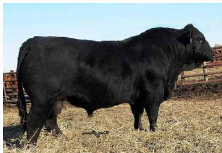
SUN RISE PILLAR 3D SIRE OF LOTS 26 & 27