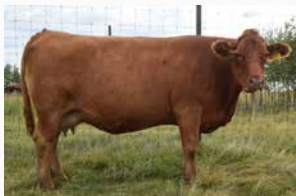
SWANTEWITT ZORIS 32Z DAM OF LOT 21

Exposed to Swantewitt 90 Proof 31F March 28-June 6. Preg checked safe likely to late Jan/early Feb calving.