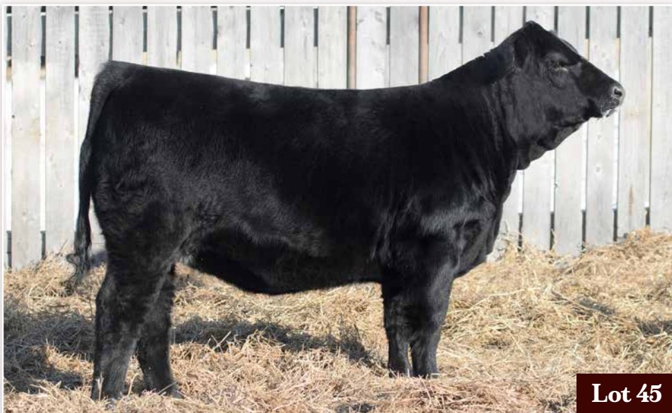
R PLUS UPPERCUT 6103D SIRE OF LOTS 44 & 45

the spring, do not miss one of the real good ones available for sale.