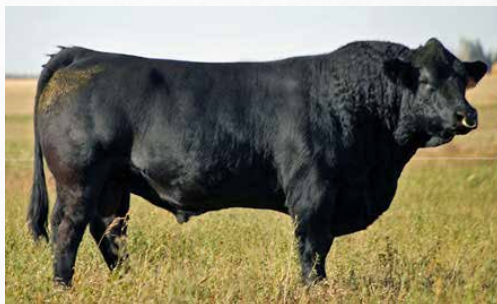
WFL ABSOLUTE 51Y SIRE OF LOT 28 SERVICE SIRE TO LOT 26