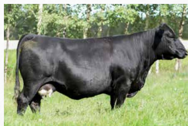
BLI SHEAR LADY 135Y PATERNAL GRAND DAM OF LOT 35