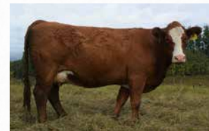
SWANTEWITT DARLING 203D DAM OF LOT 17