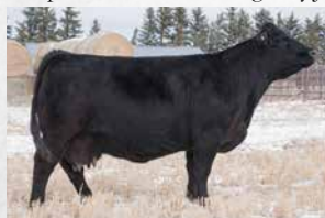
DTD HONEY BOO BOO 347A PATERNAL GRAND DAM OF LOTS 40 & 41

3/4 HOMO POLLED. This was a hard one to let go of. She has developed into one our favourite breeds this fall. She is a long bodied, attractive female that still carries power while remaining feminine in her makeup. She carries her depth of body deep into her hindquarter, and not to mention she is a baldy! 23G is a March born bred and will have some more growth in her. She is already starting to drop a nice udder with nice teat placement and spacing. Dam is a 3/4 percentage female out of Harvie Bullseye. Sire of 23G is an embryo calf that we decided to keep for ourselves out of FBF1 Combustible and DTD 347A. He has thrown some extremely good calves for us as replacements. An exciting early January mating to Bold