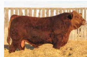
TY-D'S WITCH DOCTOR 11E SIRE OF LOT 10