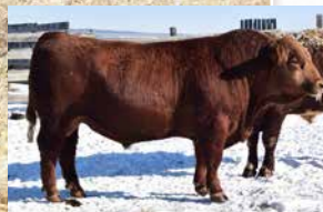
SWANTEWITT 90 PROOF 31F SIRE OF LOT 17 EXPOSED SERVICE SIRE TO LOTS 18-21

Exposed Keato Pld Directors Cut 21D March 29-May 25. Preg checked safe likely to mid to late January calving.