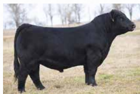
PROFIT SIRE OF LOT 46