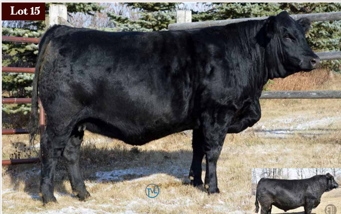
WLB BOUNTY HUNTER 365C SIRE OF LOTS 15 & 16

AI bred April 6 to WHF Limitless B011. Exposed April 23 - June 5 to IPU Approval 101G. Preg tested safe to AI breeding.