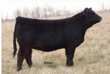
CRM/BLI AURORA 356A DAM OF LOT 35