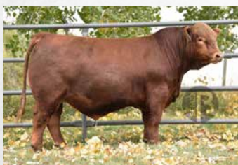
WS EPIC E152 SIRE OF LOT 2

A red blaze face Simmental bull calf that really checks all the boxes when searching for a new herd sire. Soggy middled, stout hipped while still being very sound when he's set in motion. The cow family underneath this bull calf is exceptional. With his dam at 8 years of age and grand dam at 10 years of age. Both are very functional, low maintenance and remarkable females still in production. This guy is everything we expected out of this mating to Epic. Homo Polled. Diluter Free.