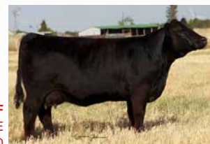
SMRT MS MOLLY 40F FLUSH MATE TO SIRE OF LOT 40