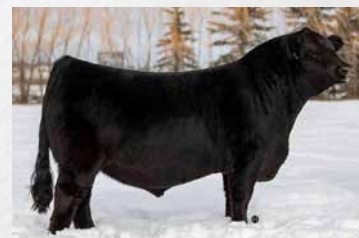
LKCC BOLD VENTURE 194F SIRE OF LOTS 38 & 39

Harlee Quin 20H is more moderate heifer calf with a lot of style. She is long bodied, pretty fronted and very structurally correct. We bought her dam out of the Western Harvest Female sale in 2015 from Czech-Mate Livestock and she never disappoints. She raises us beautiful heifer calves and good bull calves every year. 20H's dam has an awesome udder and you can already see that 20H will develop the same way.