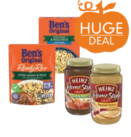
2/$4 Ben's Original Ready Rice 6-8.8 oz. Heinz Gravies 12 oz.