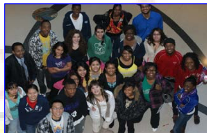
HCOP Saturday Academy 2009-2010 class