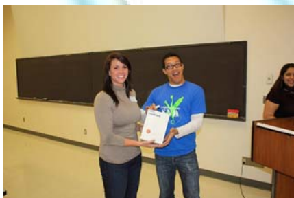
Raffle winner of a Sonicare toothbrush