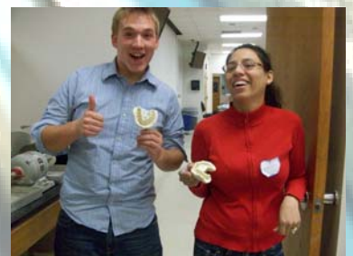
Participants showing off their impressions.