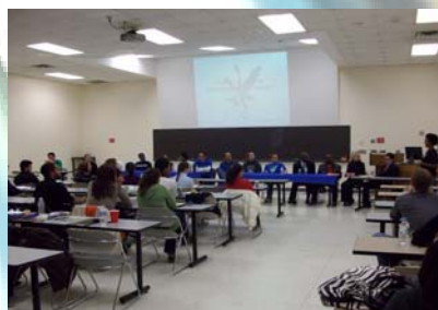
Student Panel with CUSNDA and UNMC