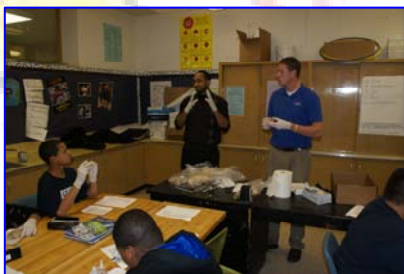
HCOP and SNMA student doing a Sheep Brain Dissection with Middle School Students

These two programs address health disparities by addressing one of the core issues, lack of representation of underprivileged in the health sciences community. These students are given the opportunity to learn more about the health sciences and hopefully will continue a path towards studying and working in the health sciences. They can be future doctors and researchers that will help subdue the difference of treatment in clinics, the difference in the cases of diabetes, and the lack of health professionals in urban communities.