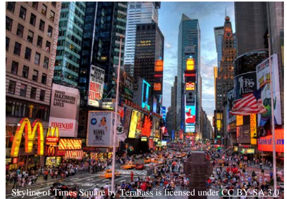
Skyline of Times Square by Terabass is licensed under CC BY-SA 3.0