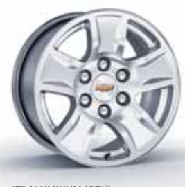
17" ALUMINUM (Q5U) STANDARD ON LT AND LT Z71