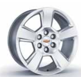
20" POLISHED ALUMINUM (RD4) AVAILABLE ON LT AND LT Z71