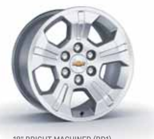
18" BRIGHT MACHINED (RD1) STANDARD ON LTZ Z71, AVAILABLE ON LT Z71