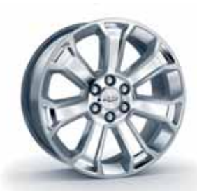
22" 7-SPOKE SILVER (SF1) ACCESSORY WHEEL<sup>3</sup>