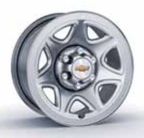
17" PAINTED STEEL (RD6) STANDARD ON WT