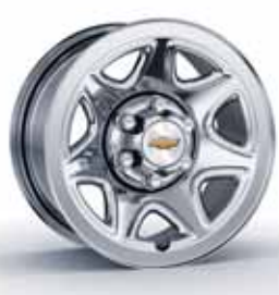
17" STAINLESS STEEL-CLAD (RD7) STANDARD ON LS