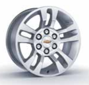
18" BRIGHT MACHINED (PZX) STANDARD ON LTZ, AVAILABLE ON LT