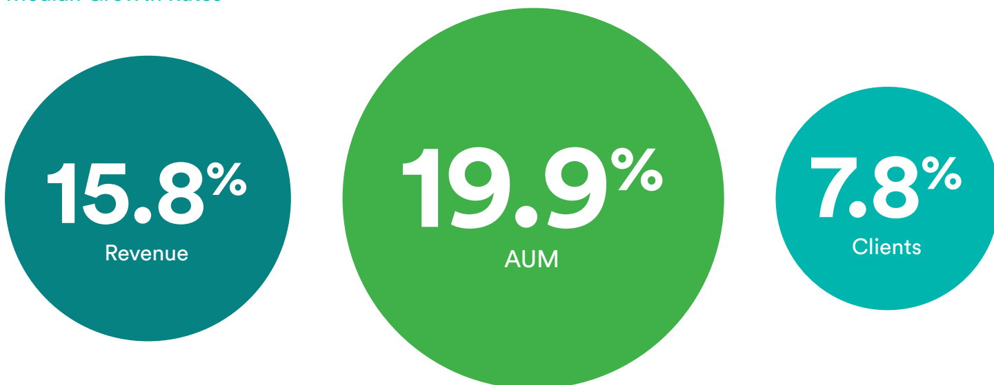
Figure 1 Median Growth Rates

After a challenging 2016, advisory firms seem to have experienced a healthy comeback in 2017 across the majority of growth indicators, with nearly three quarters of firms reporting significant growth. Median annual client growth, the growth metric most indicative of business expansion, hit a record high of 7.8%. Growth in assets under management was nearly as impressive with AUM growth for the typical firm coming in at 19.9% in 2017 versus 13.0% the year prior, and nearly equal to the record AUM growth reached in 2009.