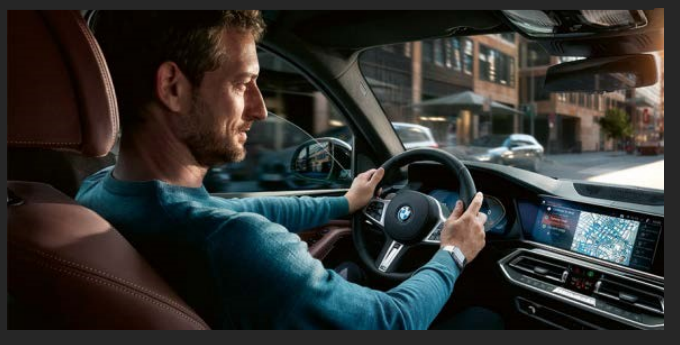
Real Time Traffic Information supplies details about the location and duration of delays, also Hazard Preview.1