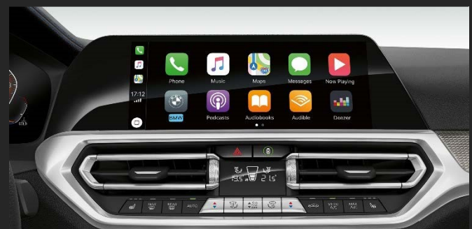
Apple CarPlay preparation enables wireless usage of your iPhone in your vehicle via Apple CarPlay and is operated via the vehicle's user interface.<sup>2</sup>