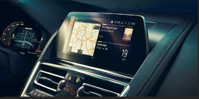
Remote Software Upgrade installs the latest software on your BMW. With Remote Software Upgrade, your BMW will always be like new. Convenient, reliable and stress-free – without having to visit your BMW service partner. Upgrades are installed over-the-air, just as they are for your smartphone.

Caring Car in your BMW will look after you. Want to arrive with fresh energy, or relax when stressed? If you say, 'Hey, BMW. I'm tired,' or 'Hey, BMW. I'm feeling stressed," the BMW Intelligent Personal Assistant will activate the Vitalize or Relax Caring Car Programme.