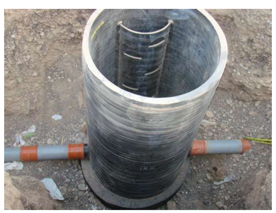
• Manhole with uPVC Pipe Connections

Each NIC HDPE Manholes is fabricated with exact orientation of inlet and outlets as per design engineers requirements.