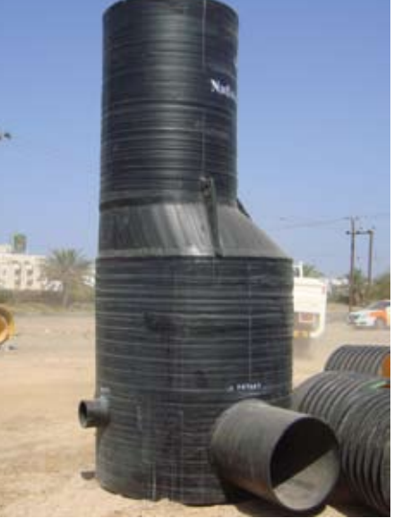
Manhole with mix connections