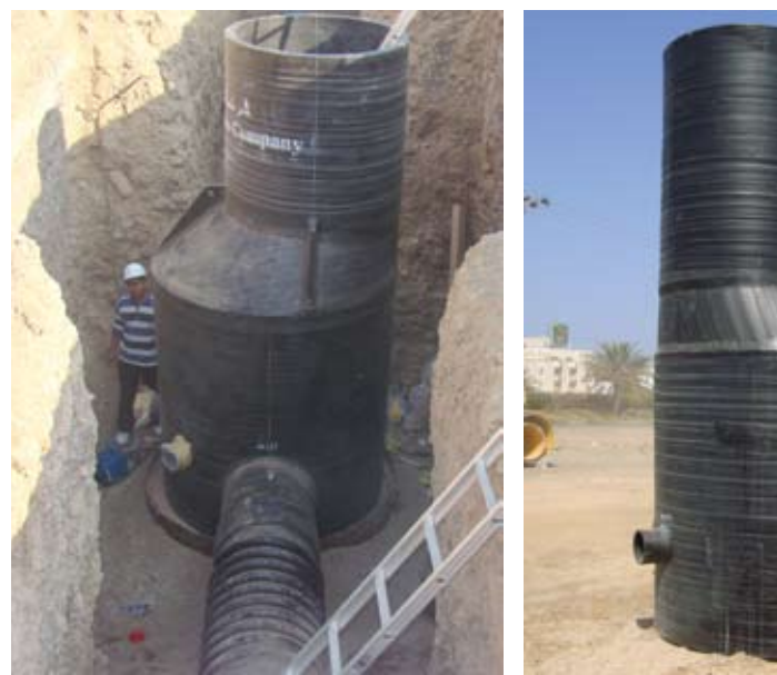
Manhole with Profiled pipes Connections