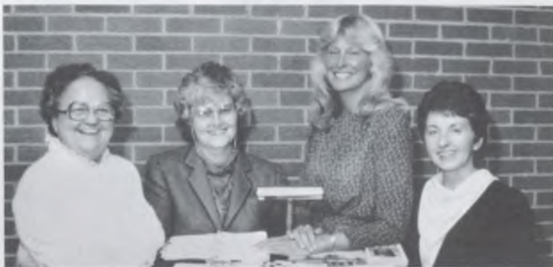
Members of the Troy, Michigan, Church hospitality team