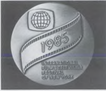
"Faith For Today" received the 1985 International Film and Television Festival of New York award in November.