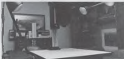
The Heritage Room's new Polaroid MP-4 Industrial View Land Camera

Located on the lower level of the James White Library, the Heritage Room contains collections of Millerite and early Adventist publications, periodicals and rare books; the private papers of former and present church leaders, historical collections and artifacts.