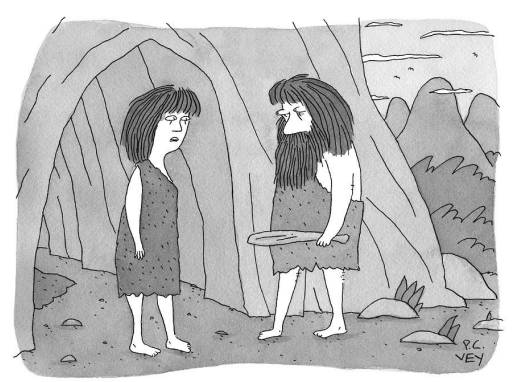
"I'd invite you in, but tracking a wildebeest and then crushing its skull has made me want to get up early tomorrow morning and invent agriculture."