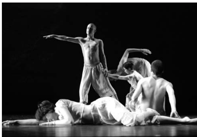
photo: Students perform Trisha Brown's "Set and Reset/Reset" during the Dance Revolutions concert.