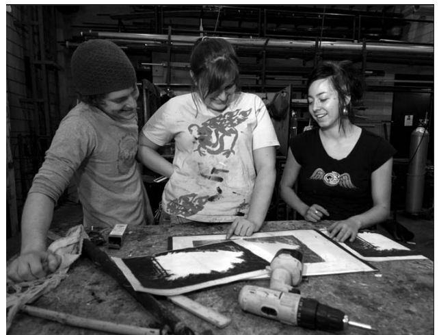
photo: Students enjoy planning for their approach to scenic painting in preparation for the 50th Anniversary summer on board the Showboat.