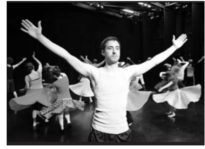
photos: Students rehearse José Limón's "Missa Brevis."