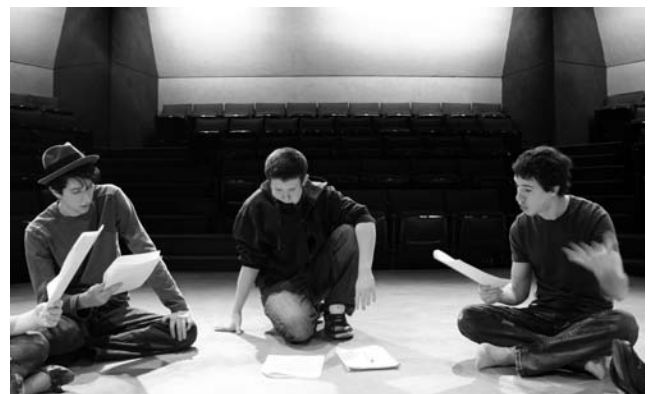
photo: Students quickly write, rewrite, and rehearse for the Xperimental Theatre’s 24-Hour Theatre